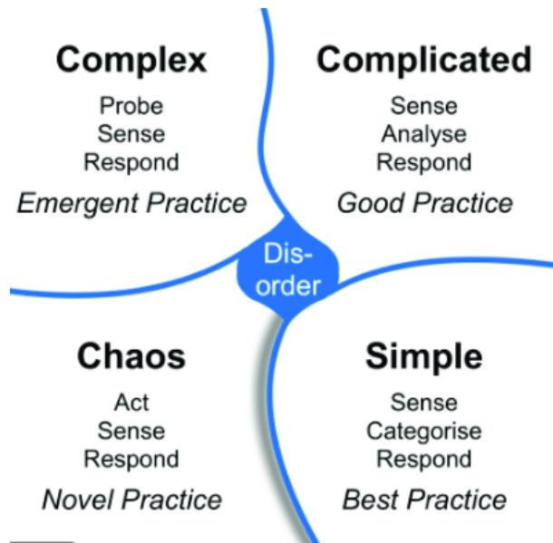
FIGURE 3 Cynefin framework (Snowden and Boone, 2007)

In the field of organizational decision-making, Snowden and Boone (2007) developed a similar model. Their well-known Cynefin framework demonstrates how managers should adapt their decision-making style to the nature of the decision and the context in which decisions are being made. They distinguish the following four contexts: simple, complicated, complex and chaotic for which they proposed four matching styles: best practice, good practice, emergent practice, and novel practice respectively (Figure 3).