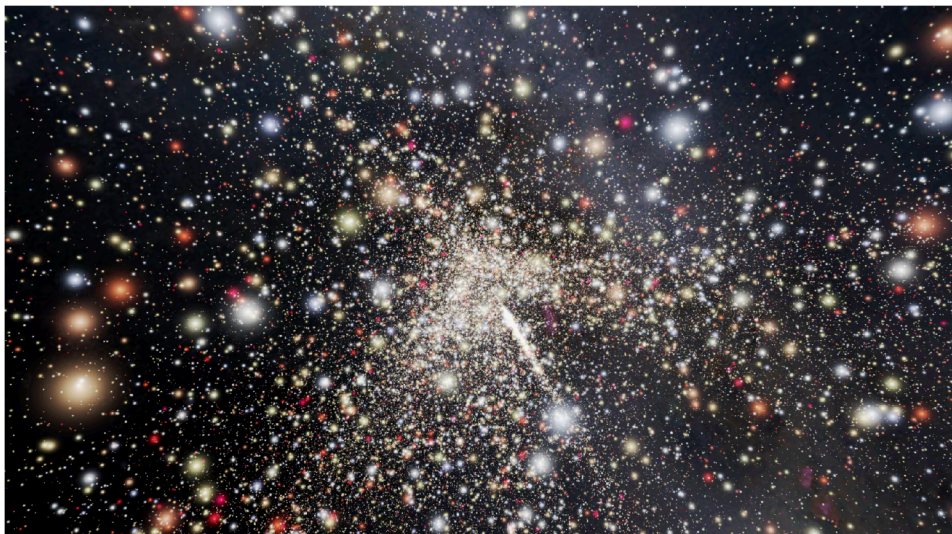
Figure 2. Globular cluster of M4 or Messier 4 (NGC6121) which has about 30,000 stars. It features a characteristic "bar" structure.