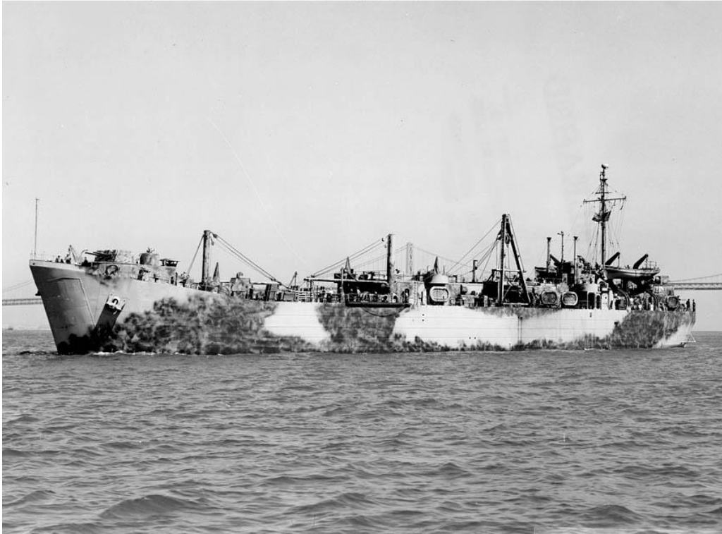
Figure C1— USS Amycus (ARL-2) in camouflage

Photo No. 19-N-51874 USS Amycus (ARL-2) on 10 August 1943