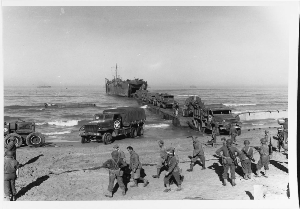
Figure 3— LST connected to a causeway

For many of the logistics tasks LST crews faced during WWII, training came on-the-job. Through some formal training, LST crews learned the basics of amphibious operations. Crews were reasonably comfortable with how to land on a beach, or how to load and unload tanks, trucks, and the standard military equipment the ship was designed to carry. But for on-the-spot procedures such as loading and securing rail cars, these new functions called for crews to simply figure out the procedure through fundamentals and a degree of trial and error. It is equally unlikely that LST crews received specific training for handling large numbers of wounded soldiers or enemy prisoners of war.