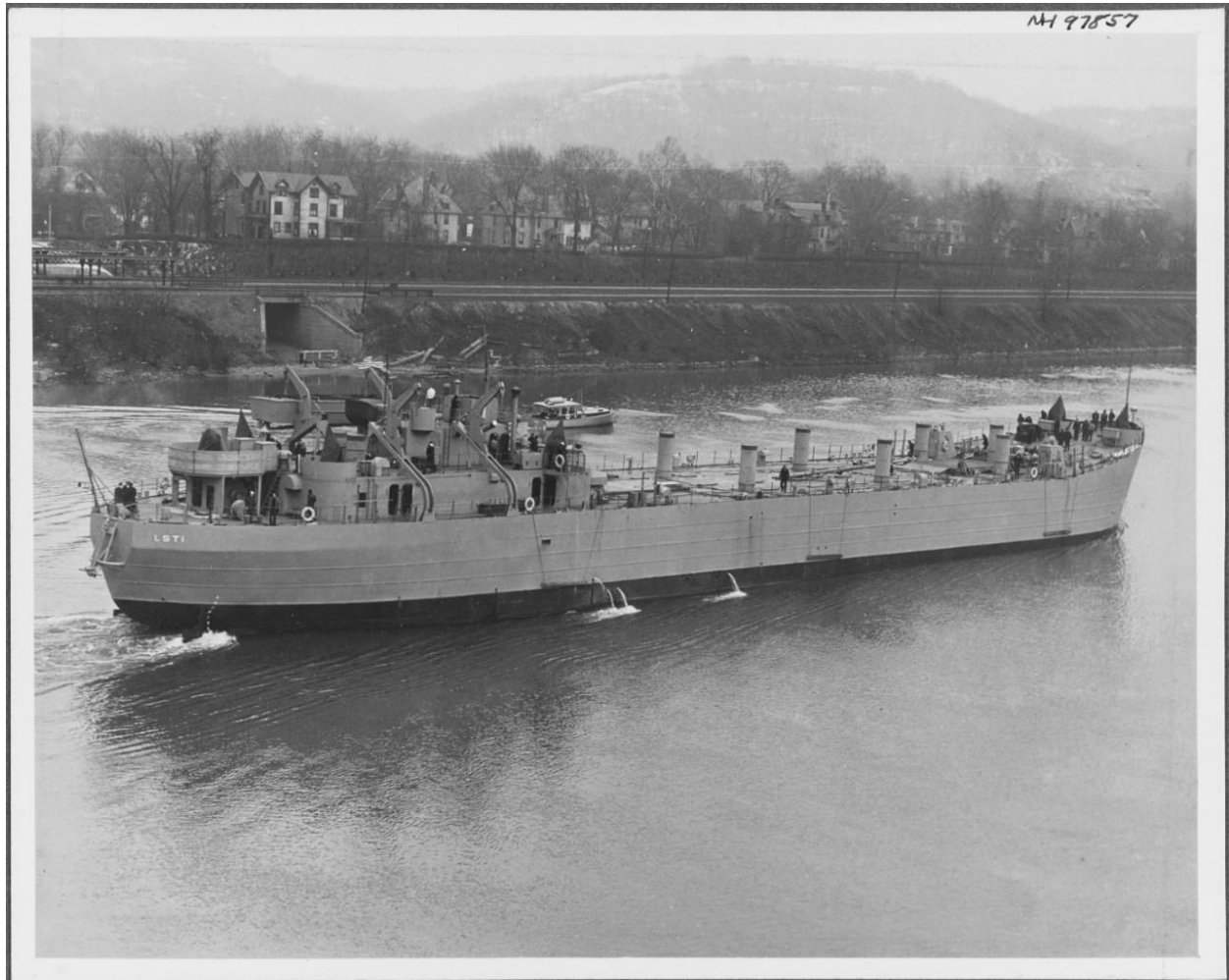
Figure 1— LST-1 in 1942

The LST did not join the US fleet in WWII with logistics as its main priority, although any amphibious ship bore some inherent responsibility for logistics support to landing forces ashore. The LST's principal mission, and the foremost inspiration for its unique design, was to land tanks and other heavy tracked and wheeled combat vehicles directly across beaches as part of an amphibious assault. By doing so, the LST revolutionized amphibious operations in its