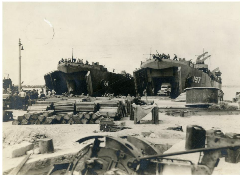
Figure 2 — LST-61 and LST-197, Sicily, 1943

HUSKY. The most significant LST logistics issues in Sicily focused on the burden of handling bulk cargo. Offloading an LST fully loaded with bulk cargo could take a full day or longer. This slow process was especially hazardous for ships attempting to offload bulk cargo during, or soon after, the assault waves. An LST only partially loaded with bulk cargo might still be delayed for several hours on the beach, not only exposed to possible enemy fire, but also monopolizing a landing spot that another waiting ship might use to offload more combat forces.