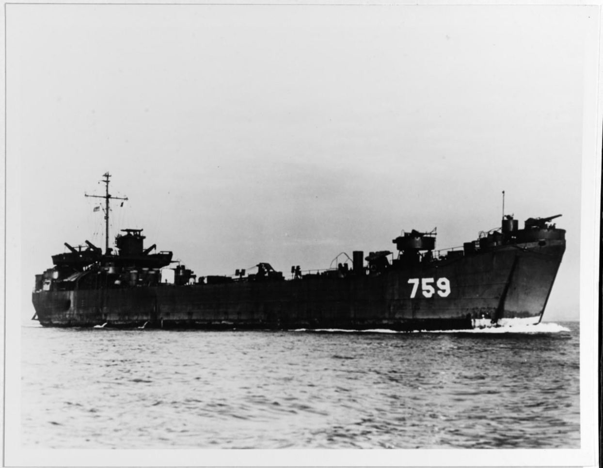
Figure B1— LST-759 circa 1945