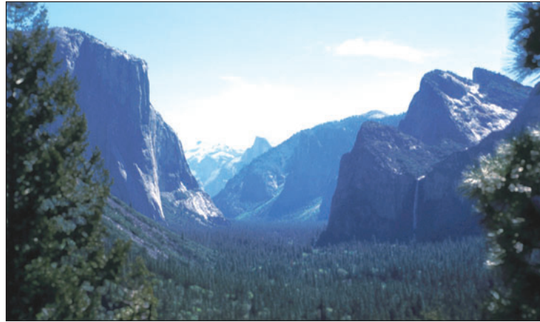
Figure 1. Iconic parks – such as California’s Yosemite National Park – were often originally protected for their scenic beauty and splendor, but are now also managed to maintain their “naturalness”. However, the concept of naturalness is proving increasingly problematic when the past history of the park is considered and when we also look to the future and the implications of climate change. The past history includes substantial Native American use and transformation of some areas, the cessation of which led to changed ecosystem structure. The future potentially holds radically different temperature and precipitation patterns and fire regimes. Therefore, the current view of the park is almost certainly different from that of the past and will also be different from that of the future.

The adequacy of naturalness as the guiding concept for park and wilderness stewardship has been challenged as protected-area goals have evolved, scientific knowledge has improved, and the sphere of human influence has become global. In today’s context, managing for some aspects of naturalness often violates other aspects of it – such as when active intervention (intentional human control) is necessary to prevent transformation by introduced species (pervasive human influence and a departure from historical conditions). However, we now know that natural ecosystems are highly dynamic (Wu and Loucks 1995). Therefore, if we are to allow for the free play of biological and physical processes, including evolutionary change, we cannot expect future park landscapes to look the same as they did in the past (White and Bratton 1980). We have also learned that many so-called natural park and wilderness ecosystems in North America have been extensively affected by indigenous peoples, particularly through burning and hunting (Kay 1995; Pyne 1997; Mann 2005). Past human influence has not been pro-