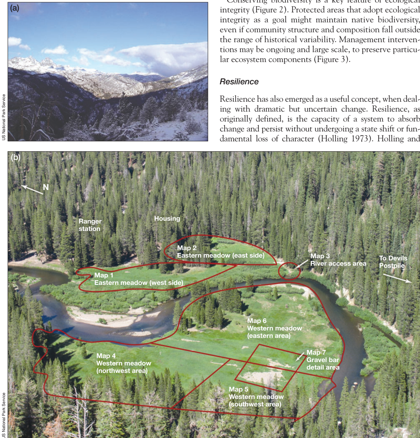
Figure 3. (a) Devils Postpile National Monument, in California, where managing the park as a refugium under climate change is being evaluated as a means to maintain ecological integrity. The location of this park, in a region of cold-air pooling (Daly et al. 2007), has been projected to protect its unusually rich biodiversity against warming temperatures by means of the buffering effects of its topography. (b) Zoned interventions, including conifer removal from meadows, aggressive control of invasives, reducing visitor impacts on meadows, minimizing groundwater pumping effects, planting native species within developed sites, and implementing a coordinated adaptive-management plan, are all being evaluated as part of an overall refugium framework.

Resilience has also emerged as a useful concept, when dealing with dramatic but uncertain change. Resilience, as originally defined, is the capacity of a system to absorb change and persist without undergoing a state shift or fundamental loss of character (Holling 1973). Holling and