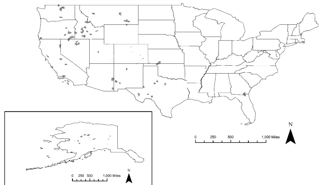
Figure 1. US Megafire Perimeters, 2010–2017. Data source: USGS GeoMAC and authors' calculations.

Data on all US megafire locations over 2010–2017 were obtained from the USGS Geospatial Multi-Agency Coordination (GeoMAC) system. The GeoMAC system is the most complete accounting of US wildfire perimeters and was originally designed to give fire managers near real time fire perimeter information on any US wildfire that was known to the National Interagency Fire Center. In addition to perimeter data, GeoMAC also provides information on the acres burned, the name or designation of the fire, and event narratives. Observations for megafires—i.e., fires whose final perimeter size was >100,000 acres—were retained for further processing. Using GIS software, we then calculated all instances of any >0% megafire perimeter overlap with each county, using data on the final megafire extent. Each county was then assigned information on the characteristics of each megafire that physically burned within its boundaries at some point during the fire event, including information on the date of fire overlap and the total acres burned by the fire. Megafires that spanned more than one county are included in the analysis and the affected counties are appropriately coded as experiencing a fire event. Figure 1 shows the final perimeters for all US megafires between 2010–2017. Most megafires occur in the western US.