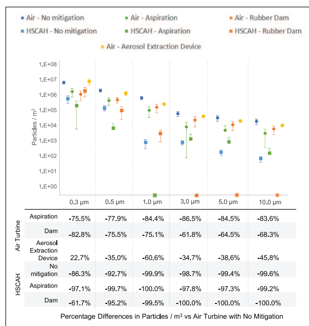
Figure 3. Particle sizing and count data delineated by handpiece and mitigation. Top: mean particles/m 3 by size, produced during aerosol-generating procedures with air turbine and high-speed contra-angle hand-pieces (HSCAH) and various mitigation strategies. Data is standardized by the baseline control. Bottom: percentage differences in particles/m 3 produced during a series of procedures versus air turbine and no mitigation. Data from the behind dentist location and the anterior position.

Acknowledging the potential for operator-induced effects, our procedures were performed by a single operator to maintain consistency of findings between variables. As every clinic/surgery varies in airflow design, dispersal levels may not be directly translatable, particularly to environments lacking mechanical ventilation. However, our data indicating the efficacy of