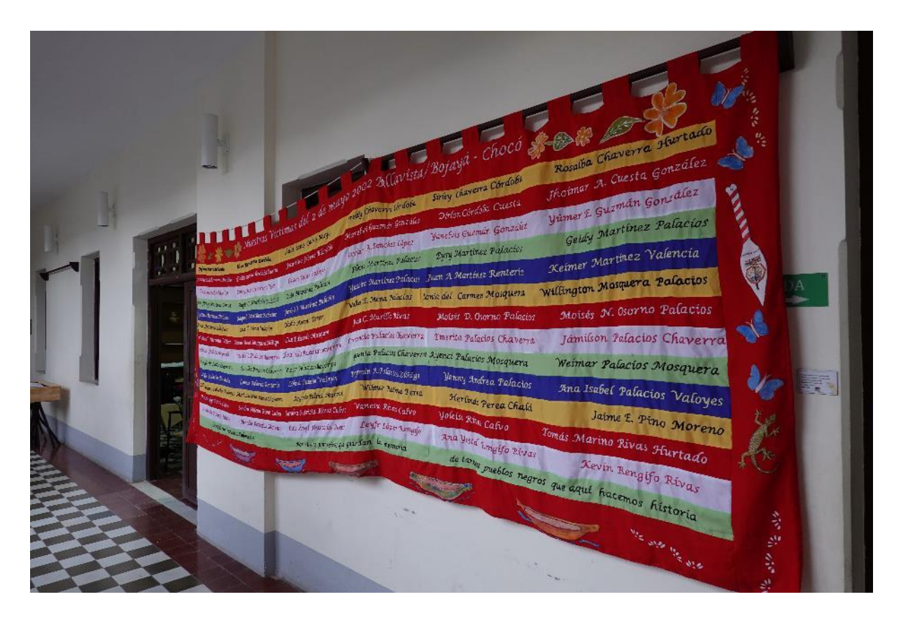
Figure 2: Telon de Bojayá. The textile panel has the following phrase embroidered at the bottom: 'By river and by jungles/ that keep the memory/of so many black towns/ that here we remember'. Credit Papadopoulos, 2019