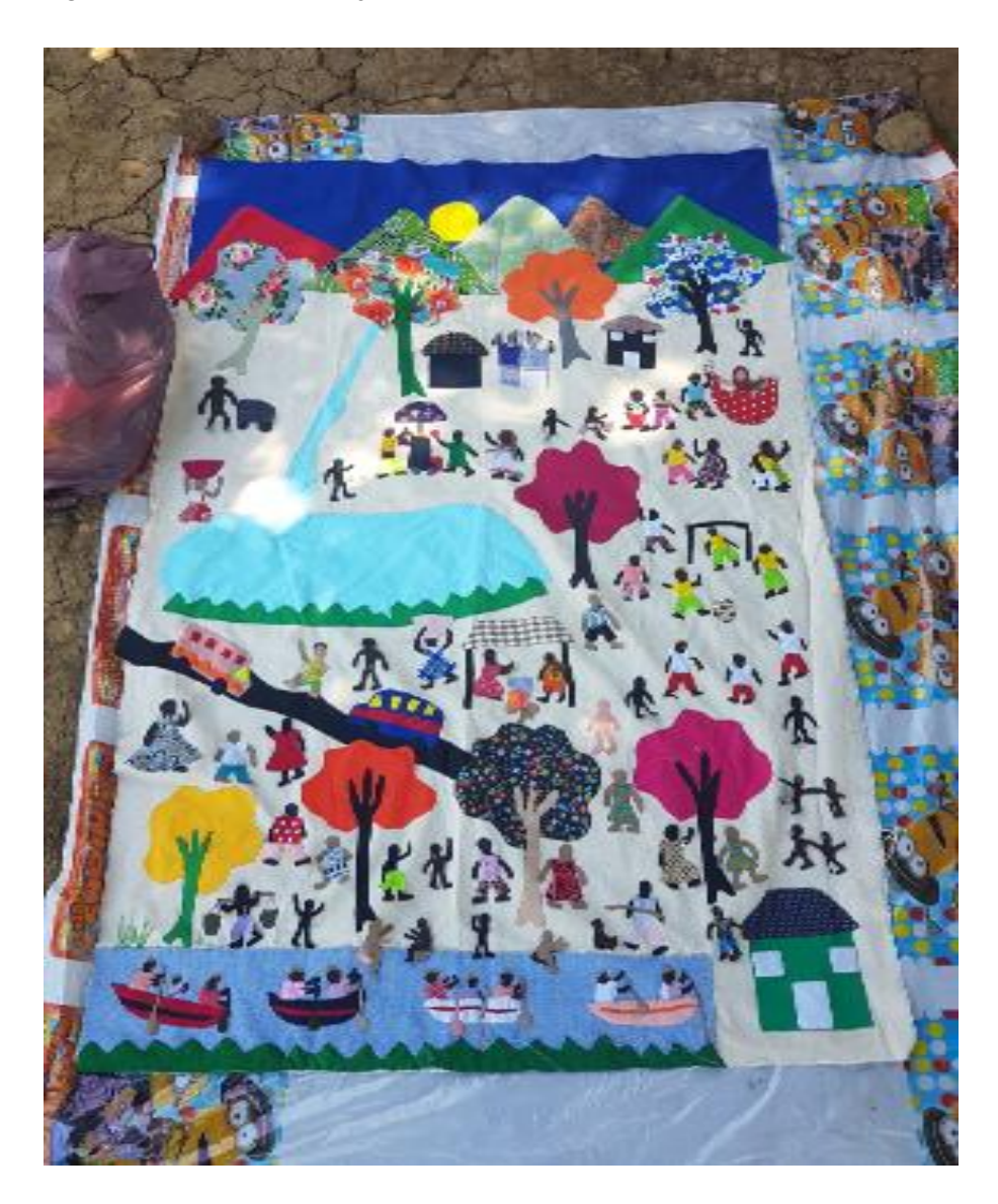
Figure 4: Tapiz de Mampuján.