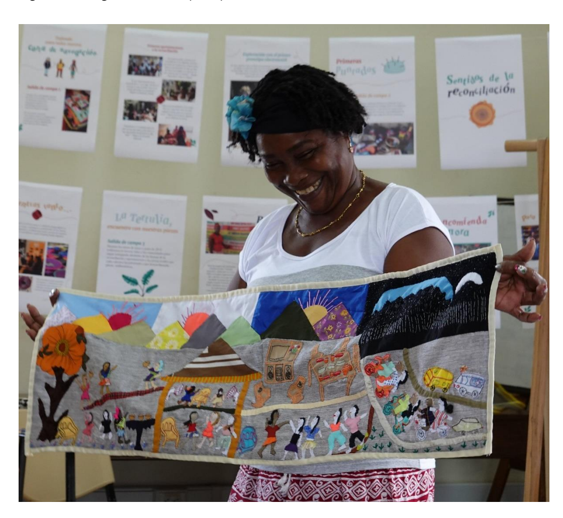
Figure 6: The gift.