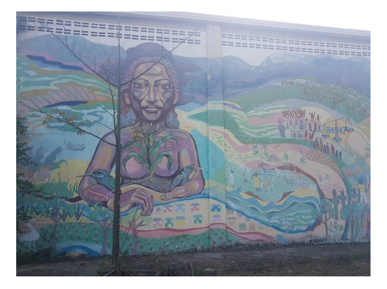
Figure 1: Mural of Mampuján: 'Diáspora y Retorno' (Diaspora and Return).