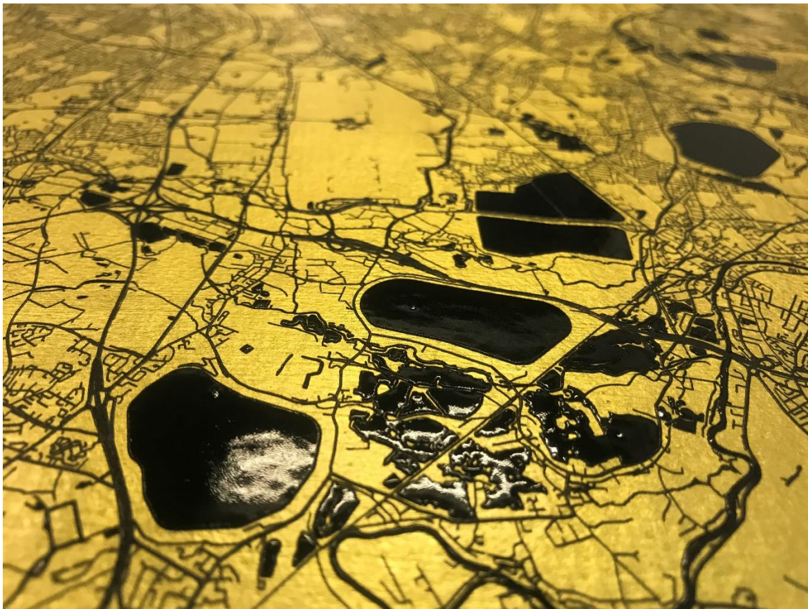
Figure 1 Detail from Streets of Gold (2019) UV (ultraviolet) varnish on 24-carat gold leaf (113 x 113 cm) by Warren Vick and Ewan David Eason. Reproduced courtesy of the artists.

We begin this new Volume with a tale of two cities. Or, more precisely, with a reflection on the two most recent winners of the British Cartographic Society Award that offer a new perspective of Paris (the 3D wooden cartefact by David Kidd; see Issue 56.1) and of London ( Streets of Gold , an aureate portrait of the city by Warren Vick and Ewan David Eason; see front cover and Figure 1). The success of these entries is worth exploring, since they were both designed primarily to be admired as desirable objects rather than as useful conveyors of geographical information. This would appear – at least in the United Kingdom – to reflect a shift towards a greater appreciation of the artistic elements of cartography in the world of professional (or formal) map-making. To the wider world, saturated by the utilitarian sterility of web map servers, this perhaps implies that novelty and aesthetic appeal are valued above all else within the cartographic community. While beauty has tended to be seen as a virtue rather than as a means to an end, both winners exploit the materiality of mapping, whether the strength of their appeal lies respectively in their tactile or visual aesthetic. Indeed, both possess an allure that invites all to stop and gaze.