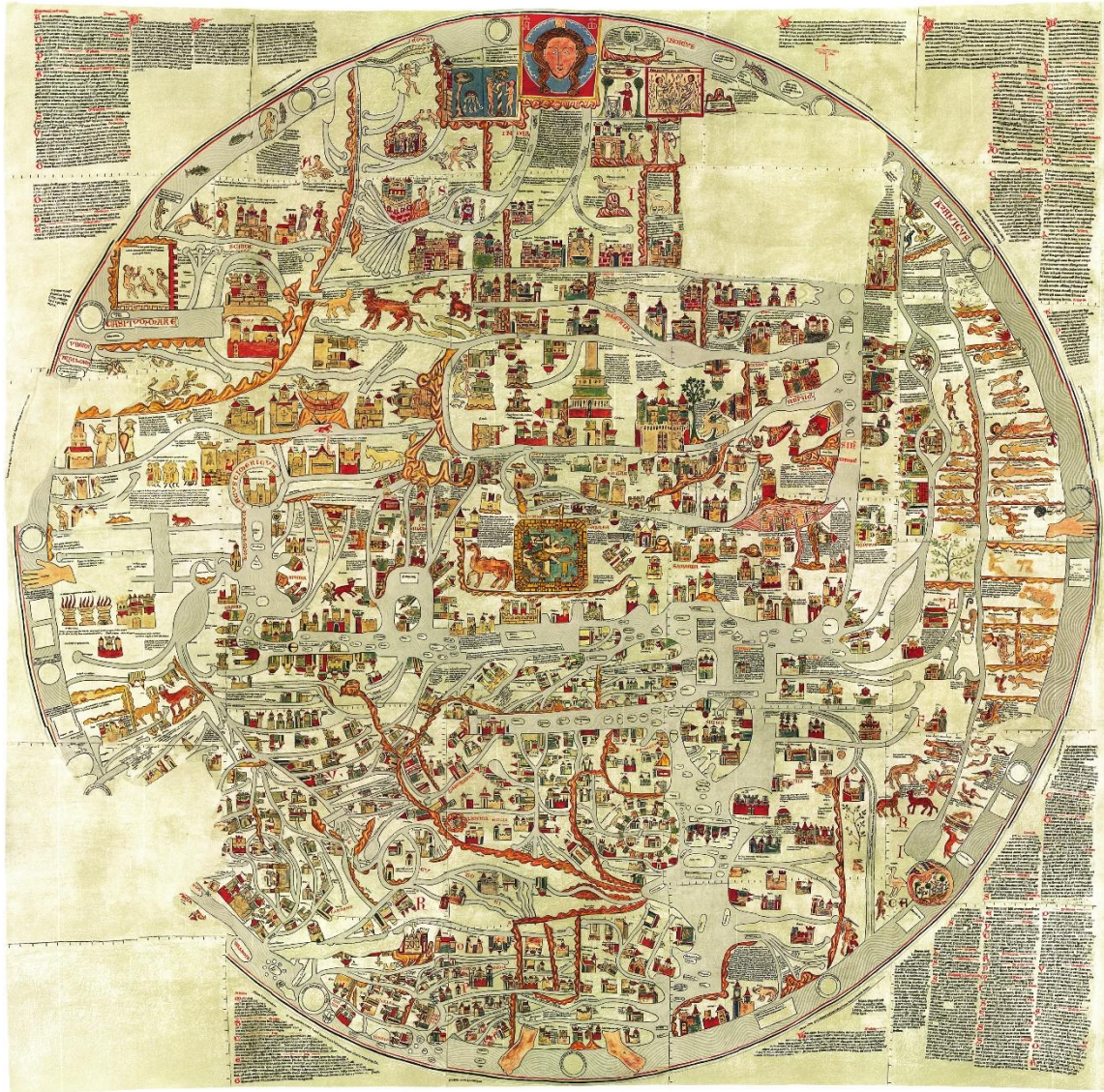
Figure 2 The Ebstorf mappa mundi (c.1300) (digital composite derived from colour reproduction of the original 30 parchment sections, c.360 x 360 cm).

The process of mapping is, however, always broader and more versatile than we can ever really imagine. Maps have a unique capacity to challenge and to change the way we see. As abstract forms, they are symbols of something greater than themselves. They can elegantly support or supplant the goal of communicating geographic information with that of making an artistic or political statement. If art transfers emotion (Tolstoy, 1995), perhaps Streets of Gold carries especial resonance because it evokes a deeper, more emotive message of placing confidence in London to illuminate the post-Brexit global economy, echoing Dick Whittington's hope (and perhaps its realization). As told by Vera Southgate (1966: 12) in the Ladybird edition of the story: 'When Dick had got over his first wonderment, he began to look for the streets that were paved with gold. Nowhere could he find them'. As with all maps that offer immersion into a utopian ideal, Streets of Gold hides unpleasant realities; in this case, those of a highly polarized city whose socio-economic inequalities are quite literally glossed over with gold leaf.