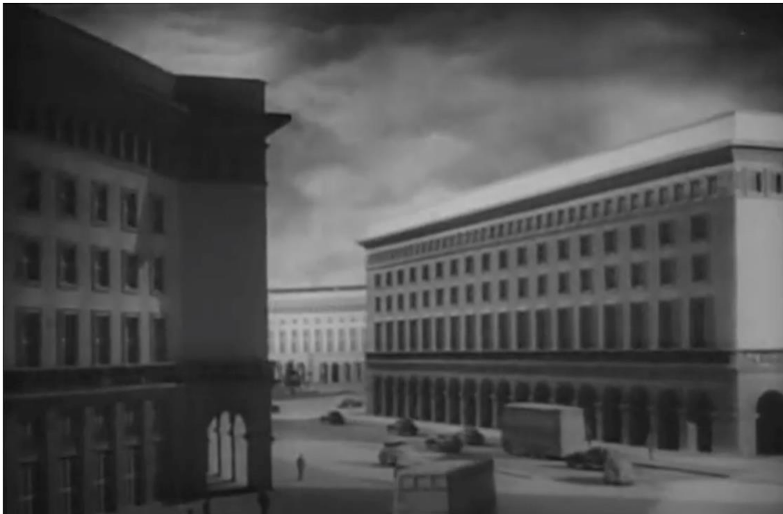
Figure 8: Models for the Future Germania. Brutality in Stone . Screenshot.