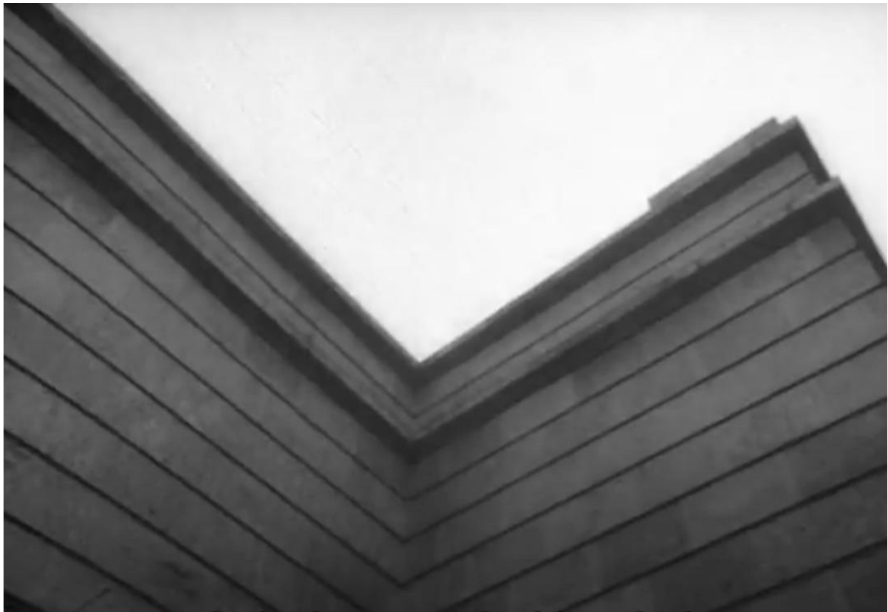
Figure 2: Fragmented architectural buildings. Brutality in Stone . Screenshot.