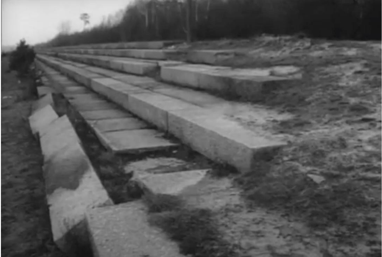
Figure 3: Dilapidated steps in Brutality in Stone . Screenshot.

As Kluge himself has said in relationship to the realities represented in his films, the films are “constructed” to offer multiple histories, narratives and possibilities of interpretation. Never one to impose an interpretation on a spectator, always preferring to create a provocation to “the film in the viewer’s head”, Kluge’s experimental process is designed to evoke, to use critic Peter Lutze’s term, an “imaginative” response. 10 In turn, if the film in the spectator’s head is determined, as Kluge has repeatedly claimed, “from the perspective of today”, the film’s meaning is located in its experience. The film in the spectator’s mind, created through Kluge’s particular montage process, becomes the real (as in authentic) history represented. As Lutze describes it in relation to The Power of Emotion (Die Macht der Gefühle, 1983) , the montage process is complex and varied, thus enabling unique and multiple possibilities for historically inflected interpretations from different spectators (115–21).