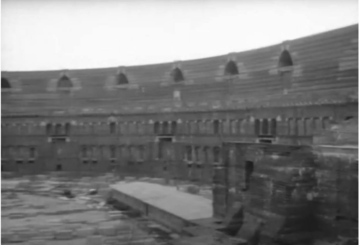
Figure 7: Unfinished Congress Hall. Brutality in Stone . Screenshot.