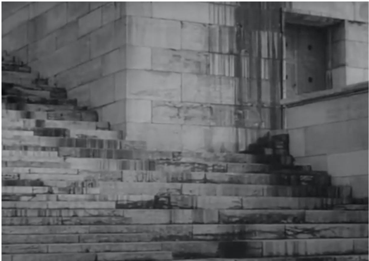
Figure 1: Camera ascending staircase in Brutality in Stone ( Brutalität in Stein ), by Alexander Kluge and Peter Schamoni. Alexander Kluge Filmproduktion, 1961. Screenshot.

representation of architecture—Leni Riefenstahl’s Triumph of the Will ( Triumph des Willens , 1935)—the structures of the Nuremberg rally grounds, as well as buildings in the city centre draped in swastika banners, are shot through wide-angles and long shots to convey the immensity of the buildings, monuments and symbols. When they are accompanied by low-angle shots of speakers at the podium, looking up to the sky from the base of flag poles, and through a moving camera that follows a Mercedes motorcade through the city streets, architecture and camera come together to emphasise the power and heroism of Hitler and the Reich. By comparison, Brutality in Stone offers a counter-monumentalisation of the architecture as site of ideological spectacle. 5 In doing so, the film creates a cognitive and associative site of memory, rather than an ossification of the ruins and their complex historical significance. As I demonstrate, Brutality in Stone presents the architecture as a conglomeration of fragmented ruined surfaces, rather than as an oneiric symbol of an authoritarian regime.