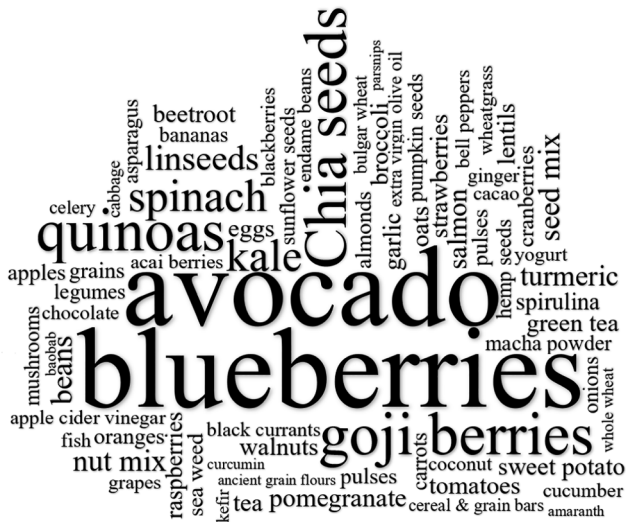
Fig. 2. Word cloud of superfoods.

heterotrait–monotrait ratio of correlation suggested by Henseler et al. (2015). The results in Table 6 suggest that the ratios for all the constructs are below the threshold of 0.85 and thus confirm that the constructs are discrete from each other.