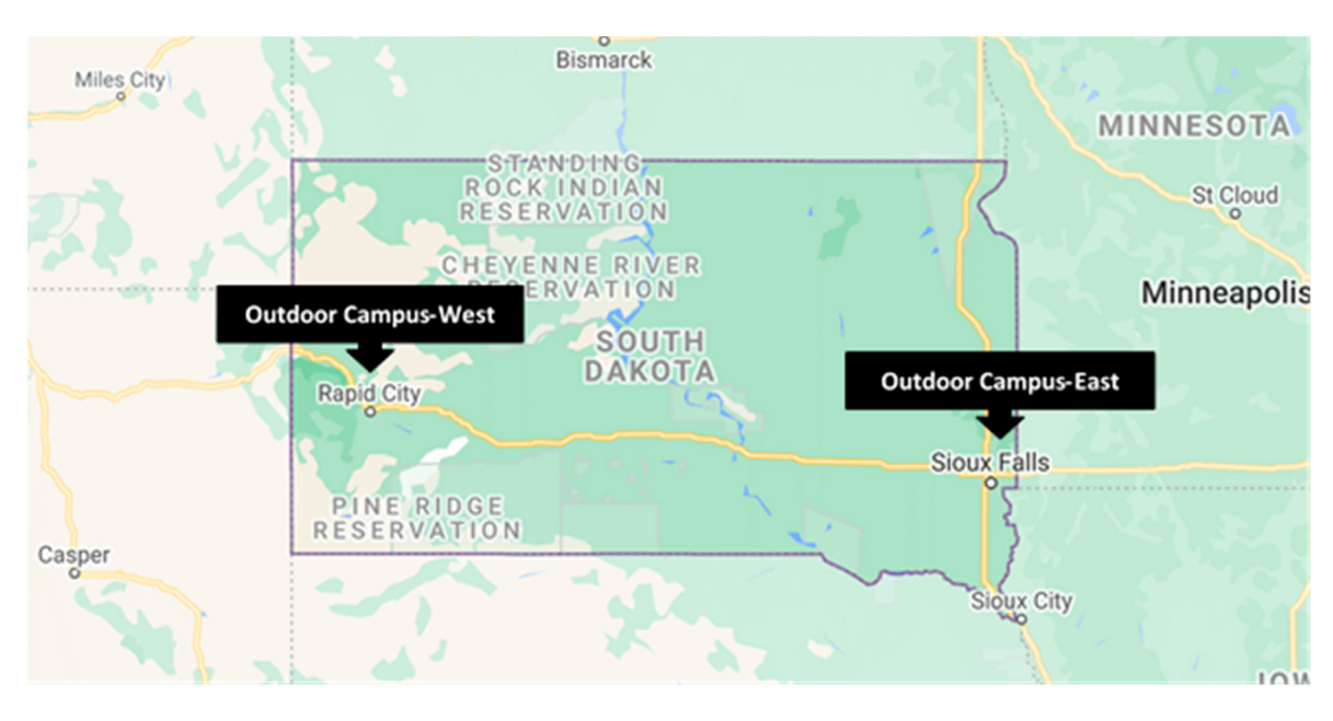
Figure 2. Map of outdoor campus locations in South.

Two Outdoor Campuses (OCs) in South Dakota were utilized as study sites in this investigation. These two OCs are located in the two most populous cities in South Dakota: Sioux Falls, with a population of approximately 178,000, and Rapid City with a population of 75,000 (Figure 2). The Wildlife Division of South Dakota Game, Fish, and Parks (SDGFP) oversees both campuses for promoting outdoor education and skill learning opportunities in close proximity to the urban areas in the state. The main goal of the OCs is to preserve outdoor opportunities in the state through partnerships and stewardship to connect the state residents and visitors to the great outdoors supplemented with programs and outreach services for the surrounding communities and statewide to promote outdoor recreation skills (e.g., hunting, fishing, kayaking, etc.). They also offer conservation and stewardship toward the natural environment. All the services and programs at the campuses are provided at no direct cost to participants as the campuses are funded through the sale of hunting and fishing licenses in South Dakota and Pittman–Robertson/Dingell–Johnson funds. Classes at the facilities are led by a staff of full-time naturalists, seasonal interns, and over 150 volunteers.