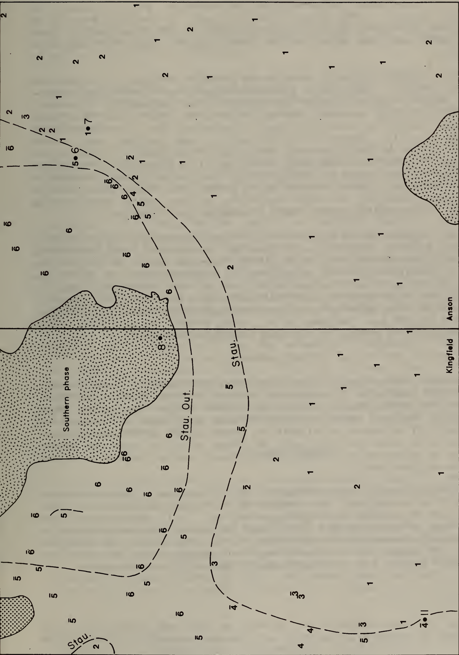
Figure 1. Preliminary map showing prograde mineral assemblages and isograds for M2 metamorphism in the area of this report. Bar over number indicates highest grade minerals >90% altered. Assemblages 4-7 may include garnet. Intrusive phases of the Lexington batholith are indicated. One inch equals 3 miles.