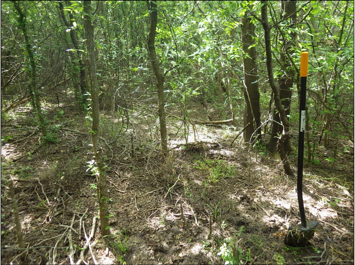
Figure 4. Wet area near southeast portion of the property, facing east.

Five shovel tests (STs) were excavated in the project area. The north-central and southeast portions of the property were not shovel tested because they were too wet. The shovel tests were excavated through the dark gray loamy clay A horizon until the very dark gray clay B horizon was reached between 32 and 52 cm below the surface (cmbs). ST1 and ST3 were excavated near the north side of the unnamed tributary. ST4 was terminated prior to reaching the subsoil because the clay was too wet to continue. No artifacts or features were identified in the shovel tests or on the surface of the property. Additionally, no landforms such as overbank levees were identified in association with the tributary. Similar landforms are known to have high potential for having prehistoric archaeological sites.