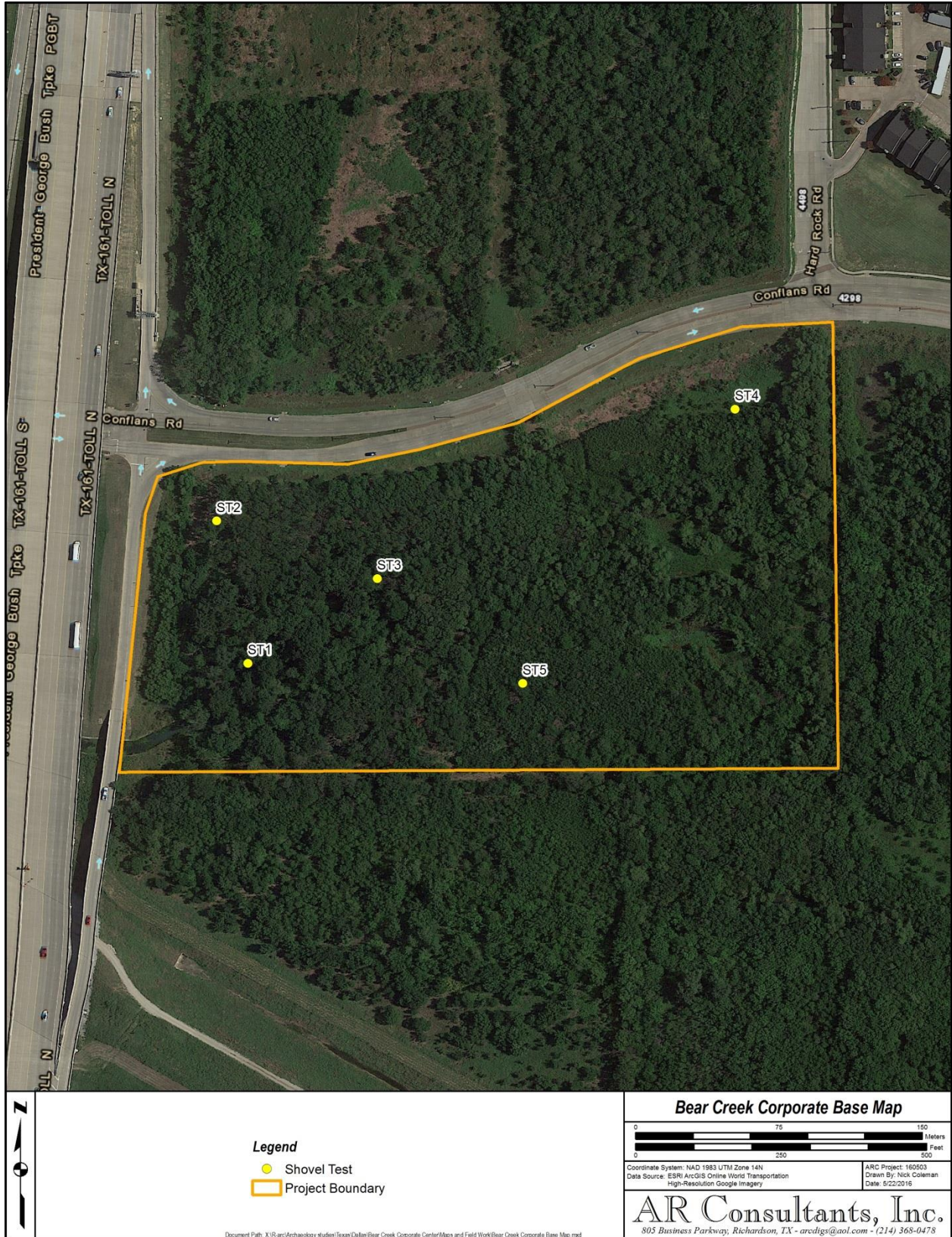
Figure 5. Bear Creek Corporate Center project boundary and shovel test locations shown on a recent aerial photograph.