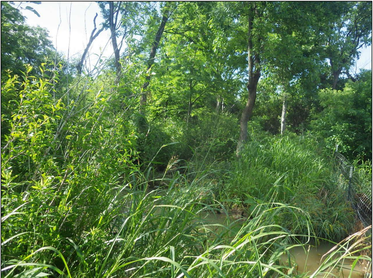
Figure 2. The Big Bear Creek tributary where it crosses the western project boundary, facing southeast.

The west side of the project area is covered in large trees, shrubs, vines, and grasses (Figure 2). An unmapped tributary of Big Bear Creek weaves through the project area from east to west. It is most easily observed on a 1958 aerial photograph of the property (Figure 3). Also visible on this photo is a drainage that flows into the tributary from the north-central portion of the property. These drainages are low and broad, allowing for a wide strip of land on either side of the channel to be inundated, as is visible on the 1958 aerial photograph. Since 1958, another low, north-south drainage has formed along the property's east boundary. The north-central and eastern portions of the property were inundated at the time of the survey. These broad, wet areas have much less grass and lower vegetation than the rest of the property (Figure 4).