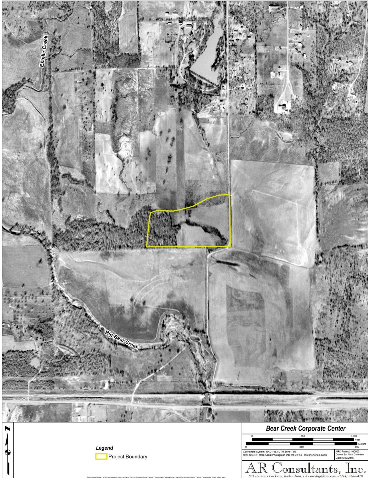
Figure 3. Bear Creek Corporate Center project boundary shown on a 1958 aerial photograph.