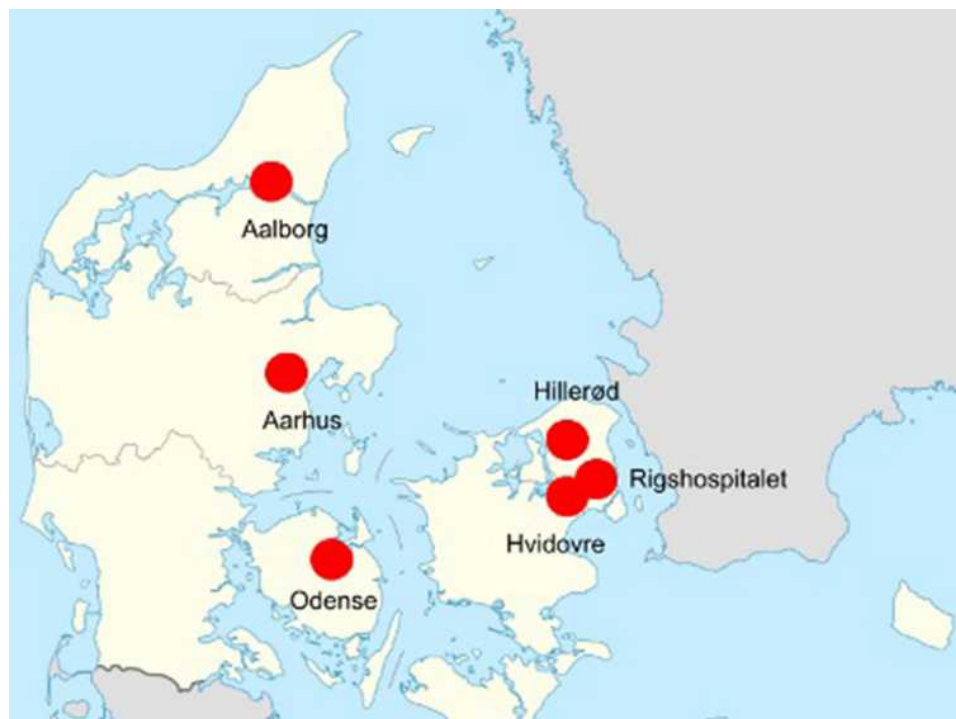
Figure 1 Geographical distribution of the involved departments of infectious diseases in Denmark.

During medical record review, the admission date of first-time hospitalization for COVID-19 was used as index date. If patients were tested positive for Severe acute respiratory syndrome Coronavirus 2 (SARS-CoV-2) while hospitalized for other reasons, the date of test for SARS-CoV-2 was considered the index date. Next, a local investigator reviewed the medical records of all hospitalized patients assigned a COVID-19 diagnosis code at each center including doctor’s notes, laboratory results, microbiological analyses, imaging results as described by the