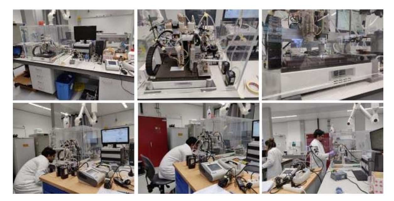
Figure 2 . Different pictures of the FAST 3D prototype installed in the research laboratory of Maastricht University, showing the deployment of instrumentation for the measurement of emissions and exposures to NOAAs, during the verification stage of the prototype design.

In general, the measurement strategy was based on the OECD tiered approach [36], by including the collection of information on the toxicology of the nanofillers (rGO, n-HA and LDH-CFX) and process characteristics (Tier 1), as well as the development of a basic measurement campaign using handled devices and filter sampling (Tier 2).