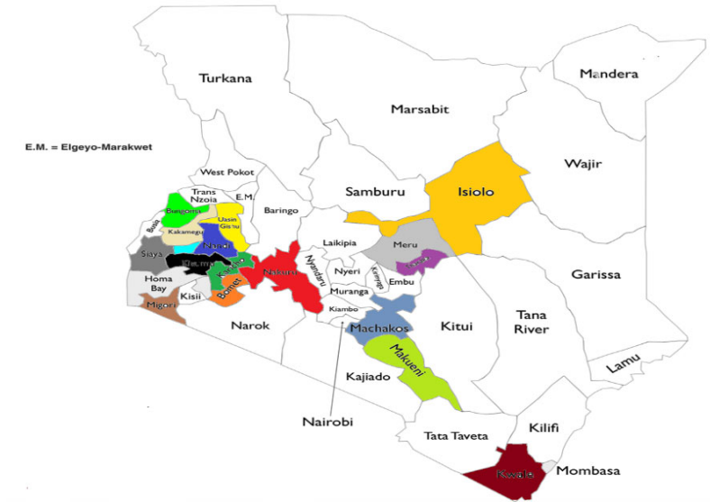
Fig 2: Map of Kenya showing the occurrence of Aflatoxin and Fumonisin in various counties

A survey conducted in five other counties in Kenya representing different Agri - ecological zones: Isiolo, Kwale, Meru, Bungoma, and Tharaka-Nithi by (Senerwa et al., 2016), found that Aflatoxin levels were high compared to WHO standards of 10\mu g/kg in both the animal feeds and milk during the rainy season. Further, the contamination from the feeds was from manufacturing industries which were attributed to poor storage. This was also compared with a study by (Njeru et al., 2019) in other five counties in western Kenya of the same Agri – ecological characteristics: Siaya, Migori, Vihiga, Kakamega, and Kisumu, showed that climatic conditions influenced contamination of maize in the farms. However, the results suggested that Fumonisin was economically significant, and only a tiny proportion of Aflatoxin was detected. Therefore, it can be concluded that there is evidence of co -occurrence with influence of climatic conditions that are related to humidity and temperature.