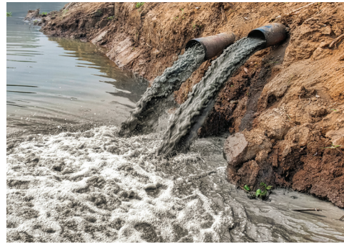
Figure 2: ICHSE: Water Landfill Runoff

Figure 2 from ICHSE: Water shows a similar situation, with polluted water from a landfill running into a freshwater source. Rather than simply telling children how their lives can be affected by pollution, the inclusion of photographs from real-world scenarios can help them see how their lives can be affected, further emphasizing the importance of addressing these issues.