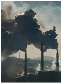
Figure 1: ICHSE: Energy Air Pollution

Kelley on the importance of images in children’s environmental books found that pictures in children’s books can have a major impact on how the reader interprets the message of the book (2017, 957). Their research found that “few images [in children’s environmental books] depicted pollution” and those that did focused solely on pollution caused by transportation rather than industries or individual actions (2017, 966). Both the ATMAD and ICHSE series discuss pollution as a cause for global warming or animal extinction in every book. Engage Books thus finds it necessary to show pollutants contaminating Earth in real-world situations. Figure 1 from ICHSE: Energy shows plumes of chemicals entering the air as a result of fossil fuels being burned, chemicals that are then breathed in by all living beings in the surrounding area.