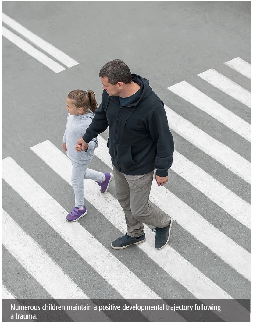
Numerous children maintain a positive developmental trajectory following a trauma.

The CBT program Prolonged Exposure was tested in two RCTs. The first trial involved Israeli teens with PTSD caused by single traumatic events, such as motor vehicle accidents (42.1%), sexual assaults (21.1%) and terrorist attacks (13.2%). 12 Most participants (81.6%) also had concurrent mental health diagnoses. Prolonged Exposure was compared to non-trauma-focused psychodynamic therapy. 12