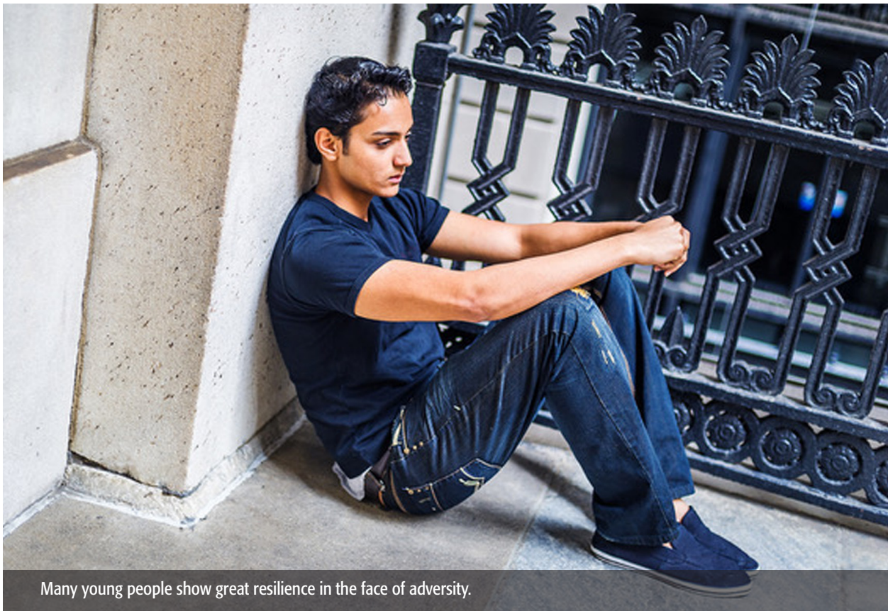
Many young people show great resilience in the face of adversity.

Prevention of such experiences therefore remains the top priority. But when prevention has not been possible and a child develops PTSD, CBT can help. Children diagnosed with PTSD need rapid access to this effective treatment — to ensure that negative repercussions of any trauma are short-lived and that children can go on to thrive. 🙌