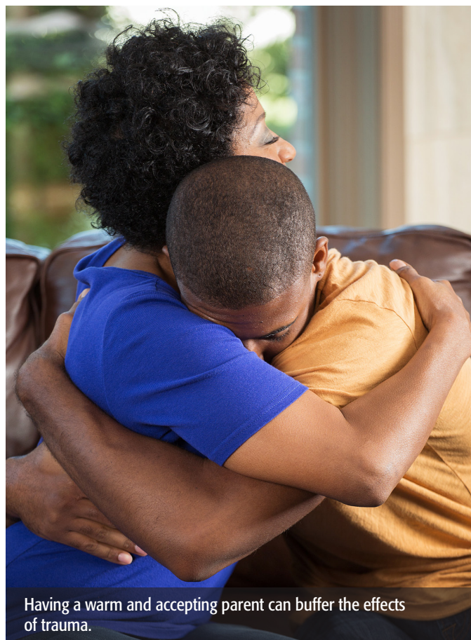
Having a warm and accepting parent can buffer the effects of trauma.

Even though the DSM-5 acknowledges different PTSD symptoms among younger children, it has been criticized by practitioners and researchers for omitting complex posttraumatic stress disorder (complex PTSD). 3 This condition is included in the World Health Organization's International Classification of Diseases , 11th revision ( ICD-11 ). 4 Calls to recognize complex PTSD as a distinct disorder arose from concerns that the PTSD diagnosis may not adequately capture the experiences of those exposed to repeated traumas. 5 Complex PTSD is recognized as typically developing after prolonged exposure to extremely threatening or horrific events such as repeated sexual or physical abuse that the child cannot escape from. Complex PTSD includes all the PTSD criteria — coupled with severe and persistent difficulties in regulating emotions, along with experiencing guilt or shame related to the trauma and challenges in sustaining relationships. 4