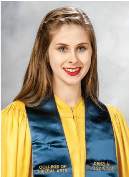
KENZI N. LOCKWOOD COLLEGE OF LIBERAL ARTS