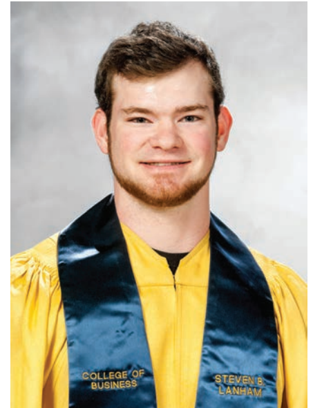
STEVEN BRIAN LANHAM COLLEGE OF BUSINESS