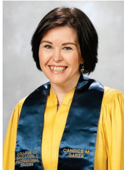
CANDICE M. GARZA COLLEGE OF EDUCATION & PROFESSIONAL STUDIES