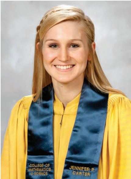
JENNIFER P. CARTER COLLEGE OF MATHEMATICS & SCIENCE