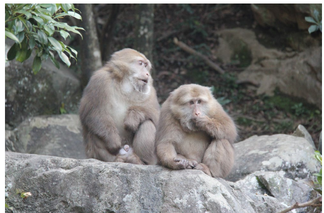
FIGURE 1 Consortship between the highest-ranking male HXM (left) and a receptive female YXX (right)

In this study, we investigated the effects of female behavioral strategies on forming consortship in Tibetan macaques ( Macaca thibetana ). Tibetan macaques live in multimale and multifemale social groups (Li, 1999). Breeding is seasonal, with the mating season from July to January, and copulations occur during both the mating (higher frequency and with ejaculation) and nonmating season (lower frequency and without ejaculation) (Li et al., 2005, 2007). Females exhibit no obvious behavioral or visual signs of estrus (Li et al., 2005). Previous studies indicate that throughout the mating season, the alpha male engaged in 64% of copulations and the beta male 21% (see Xia et al., 2013). It remains unclear how reproductive successful dominant males are, relative to low ranking males in siring offspring, with the absence of data on paternity. High-ranking males were found to frequently form consortship by following, co-feeding, monitoring, and mating with consorted female partners during the mating season (Figure 1), whereas it was rare to observe that females initiated to form consortship (Li & Kappeler, 2020; Wu et al., 2018).