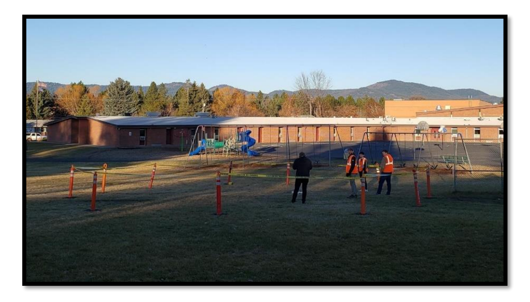
Figure 3 Delineated Drone Flight Area (at McDonald Elementary)

To ensure anonymityof the research subjects, the drone was flown at a height where the closest subject did not exhibit any identifiable features during the video playback; this height was determined through field tests to be at a minimum of 150 feet above ground level (AGL). For this study, all flights were flown at 350 feet so that the drone was sufficiently high enough to capture all key areas of geographic interest.