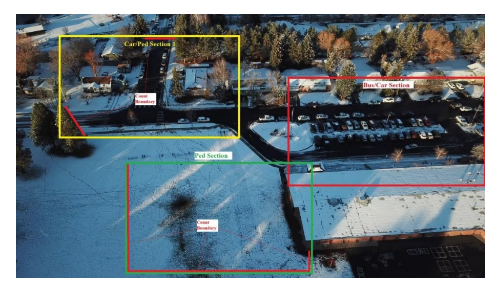
Figure 4 McDonald Elementary Cordon Lines and Boundaries