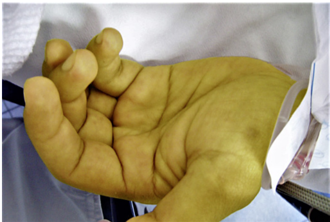
Fig. 1. Maculopapular rash on the palms.