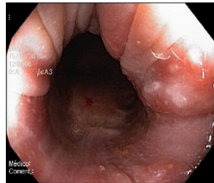
Fig. 2. Tubular rectum – hardened and erythematous mucosa with pale nodular lesions.