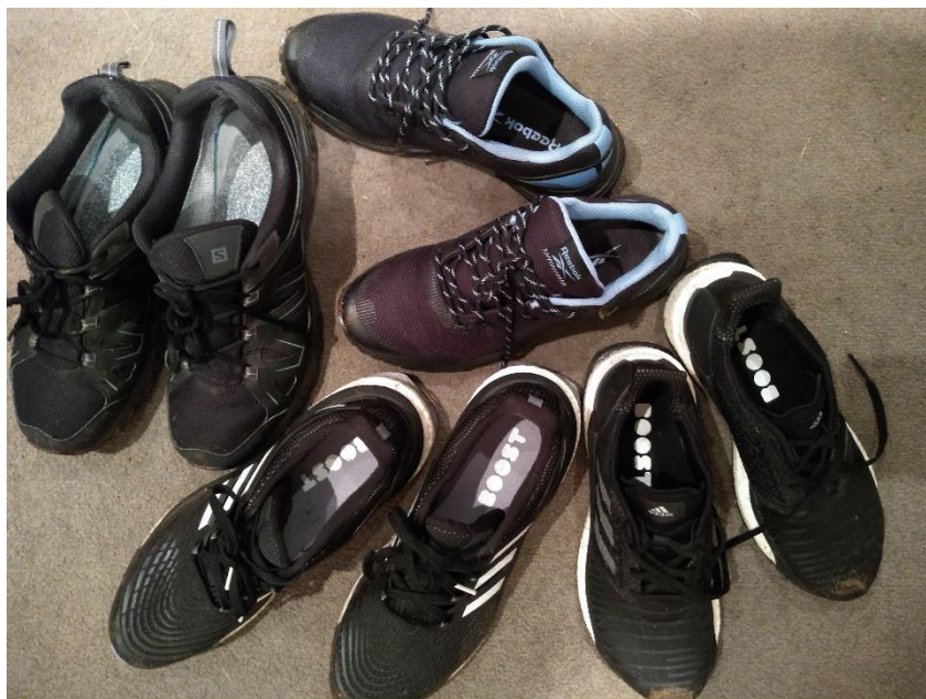
Figure 3 An image of similar footwear symbolising the sense of 'sameness' of day-to-day work and non-work activities.