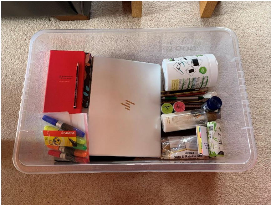
Figure 1 Efforts to organise and tidy workspaces when working at home: the work box.

frequency and duration of online meetings, both at university level and with external stakeholders, to assimilate and/or disseminate information in contrast to the pre-Covid-19 approach, which was characterised by fuller discussion and joint decision-making.