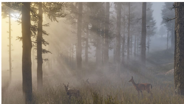
FIGURE 1 Screenshot of white-tailed deer Odocoileus virginianus from Red Dead Redemption 2.

This study aimed to investigate whether immersion in the virtual environment of RDR2 and RDO teaches players about the