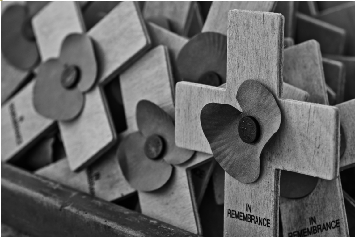
In Remembrance