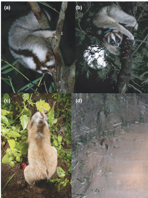
FIGURE 4 Javan slow lorises in West Java, Indonesia, demonstrating: (a) the high contrasting dorsal stripe of a juvenile feeding on an open trunk; (b) an adult female feeding on an open trunk; (c) an adult female moving on the ground; (d) an adult male on a recently cleared field

register a prone loris' dorsal stripe as the body of a dangerous snake. Qualitatively, the body color of slow lorises can match the color of the ground, potentially making the stripe potentially more visible (Figure 4d). While predation on slow lorises is rarely observed, hawk eagles ( Nisaetus spp.), orang-utans ( Pongo spp.), monitor lizards ( Varanus spp.), and pythons ( Python spp.) have all been recorded as predators (Nekaris et al., 2007, 2019). A loris is very visible in open terrain (Figure 4) but must go to the ground in times when habitat is not continuous. Furthermore, lorises regularly enter torpor in the cool dry season and reduce their activity overall. Exhibiting a higher pattern of color disruption could allow them safer and greater access to resources in the period when they are more active.