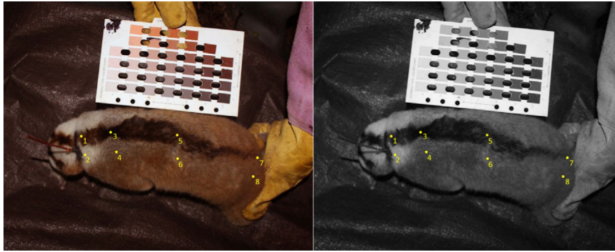
FIGURE 1 The color image (left) shows an image before conversion and analysis in ImageJ; the monochrome image (right) shows point selection for analysis, where 1 = dorsal stripe neck, 2 = nondorsal stripe neck, 3 = dorsal stripe cervical, 4 = nondorsal stripe cervical, 5 = dorsal stripe thoracic, 6 = nondorsal stripe thoracic, 7 = dorsal stripe lumbar, and 8 = nondorsal stripe lumbar regions. Contrast ratios were calculated between each dorsal stripe region and its corresponding nondorsal stripe region

of observation as a response variable (this ranged from 0 to 9). We included the individual as a random term.