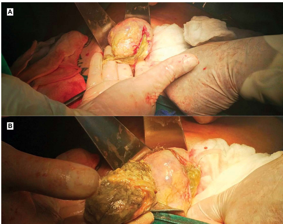
Figure 3. Intraoperative image during laparotomy: a ruptured cyst of the right ovary containing hair.