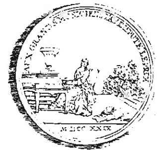
2. Copy, sculpt.