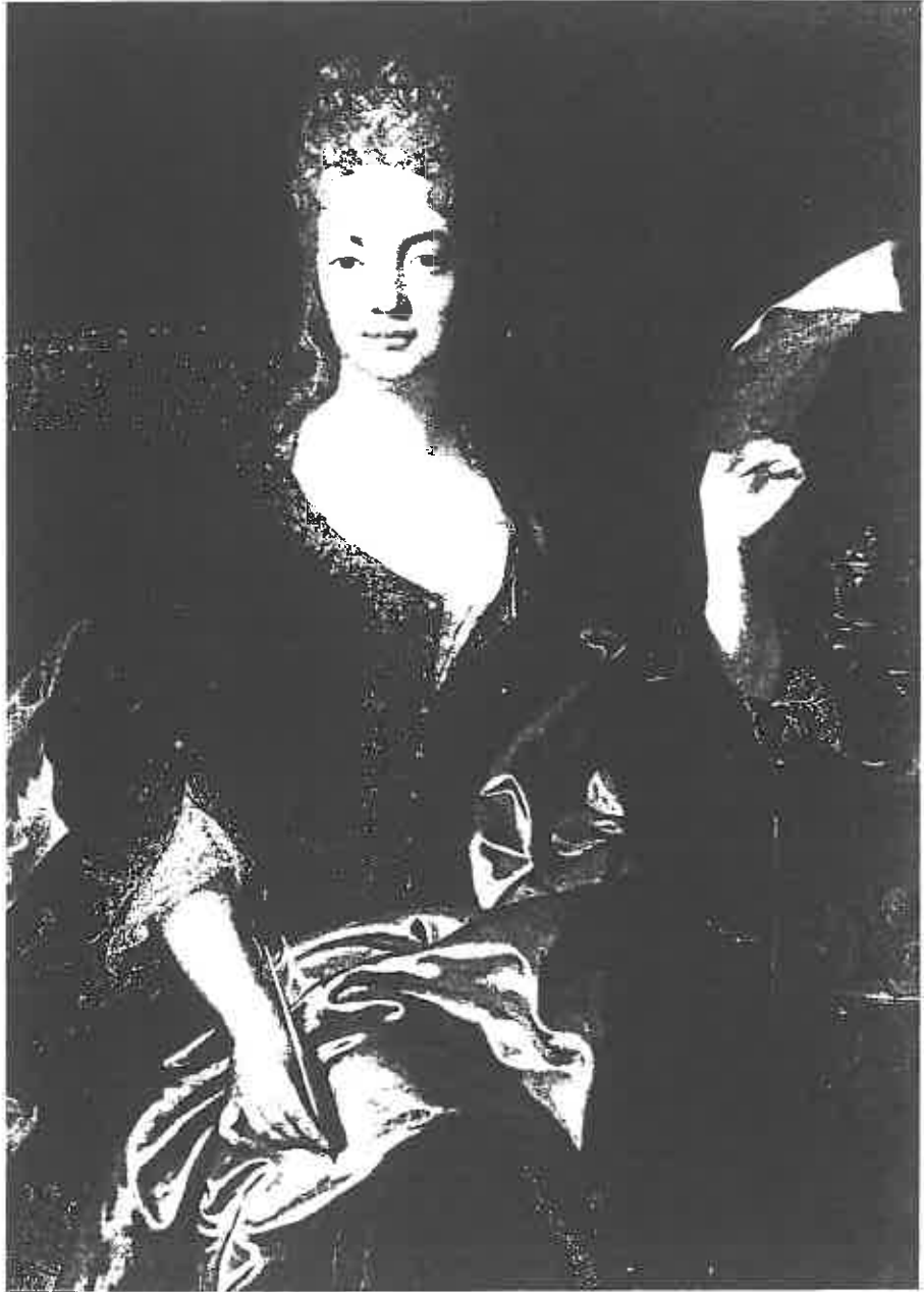
Fig. 3 François de Troy (1645-1654), Madame Jacquet de La Guerre , c. 1695, oil on canvas, London, private coll.