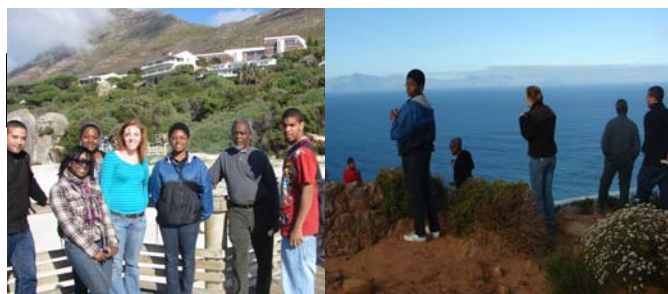
Fig. 3: Figure 3: CFNM team (a) visiting an African Penguin Colony and (b) at Cape Point

Essential to the success of the Program was an ongoing research collaboration between the laboratories in the CFNM and those at the iThemba LABS. The collaboration