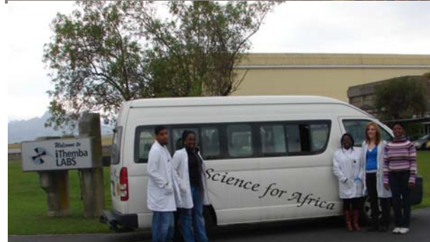
Figure 2: CFNM team (a) with colleagues in front the Materials Research Building and (b) in front of the Main Building at iThemba LABS