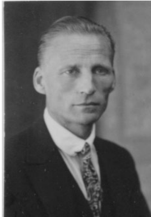
Figure 2. L.E.J. Brouwer

The other element that contributed to his fame is his work on the foundations of mathematics. Brouwer was not only a mathematician, but also a philosopher with a strong mystical accent. He completely rejected the two then current theories on the foundations of mathematics; the logicism by Russell, and the formalism by Hilbert. For Brouwer, mathematics was rooted in, and created by the human mind. Crucial is the observation of the permanency of objects during consecutive points of time. That fundamental intuitive sensation of time gives, according to Brouwer, birth to the concept of counting and the series of natural numbers. All mathematics is built on this series. The continuum on the other hand, cannot it be constructed from natural numbers, nor does the continuum consist of all numbers. The continuum is in fact the separation between two different numbers, and you can construct new numbers on this continuum, but that does not mean that the continuum is merely a collection of numbers. As a consequence, Brouwer accepted the existence of mathematical objects only when they could be constructed in a finite number of steps. This principle gave birth to his intuitionistic mathematics, in which parts of the traditional mathematics were rejected, or at least were questioned.