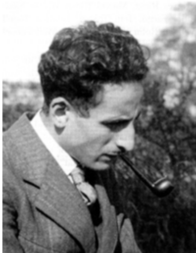
Figure 1. Hans Freudenthal 1905-1990.