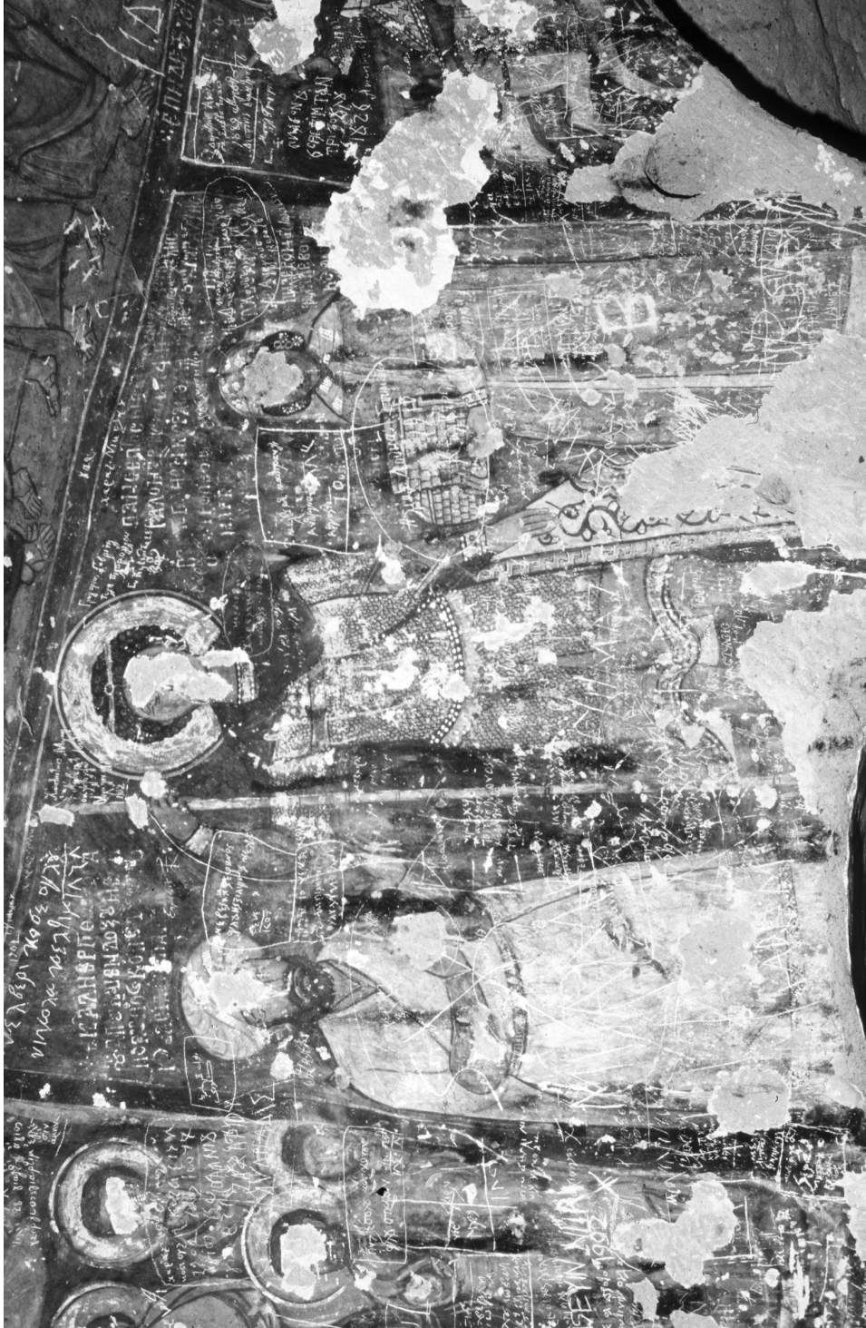
Fig. 3: Saint George church in Belisirma.