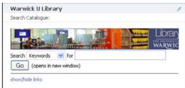
Figure 2. Warwick's Facebook catalogue application

and launch the catalogue application (see Figure 2), which now has 724 users.