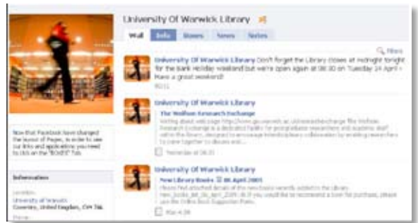
Figure 4. The University of Warwick library Facebook wall

Since March 2009 'pages' are now called 'public profiles' 11 and they function much like the personal profiles that individuals have. The main issue I have had with this is that fans visiting the public profile are now presented with the wall (see Figure 4), and the rest of our content is hidden away in tabs behind it. What this means is that any photos, videos, links or applications you have added to your public profile are not immediately visible to your fans. It also means that unless you post content to your wall your public profile will appear to be inactive when fans first land there. In order to get around this we have fed our library blogs through Yahoo Pipes and into Facebook Notes, which will then feed the content onto our wall. (Instructions on how to do this can be seen on my blog. 12 )