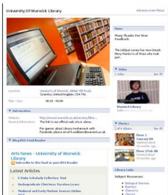
Figure 1. The University of Warwick library's first Facebook page

Once the Page was created a few colleagues had a quick look at it and a few changes were made. And then it was live within a matter of days. It looked something like Figure 1.