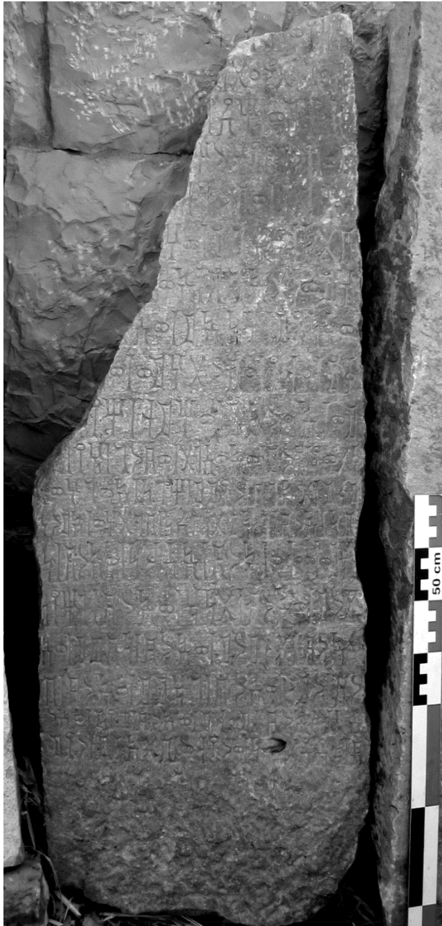
Figure 2: Inscription Jabal Riyām 2006-17.

The unknown authors of the text give thanks to Ta'lab Riyām, the main deity of the tribes of Ḥāshid and Ḥumlān in his sanctuary on the Jabal Riyām, in order to gain the favour of their lords of the lineage of Bata' as well as fruitful crops and harvests. They follow the common format of a dedication usually made to this deity.