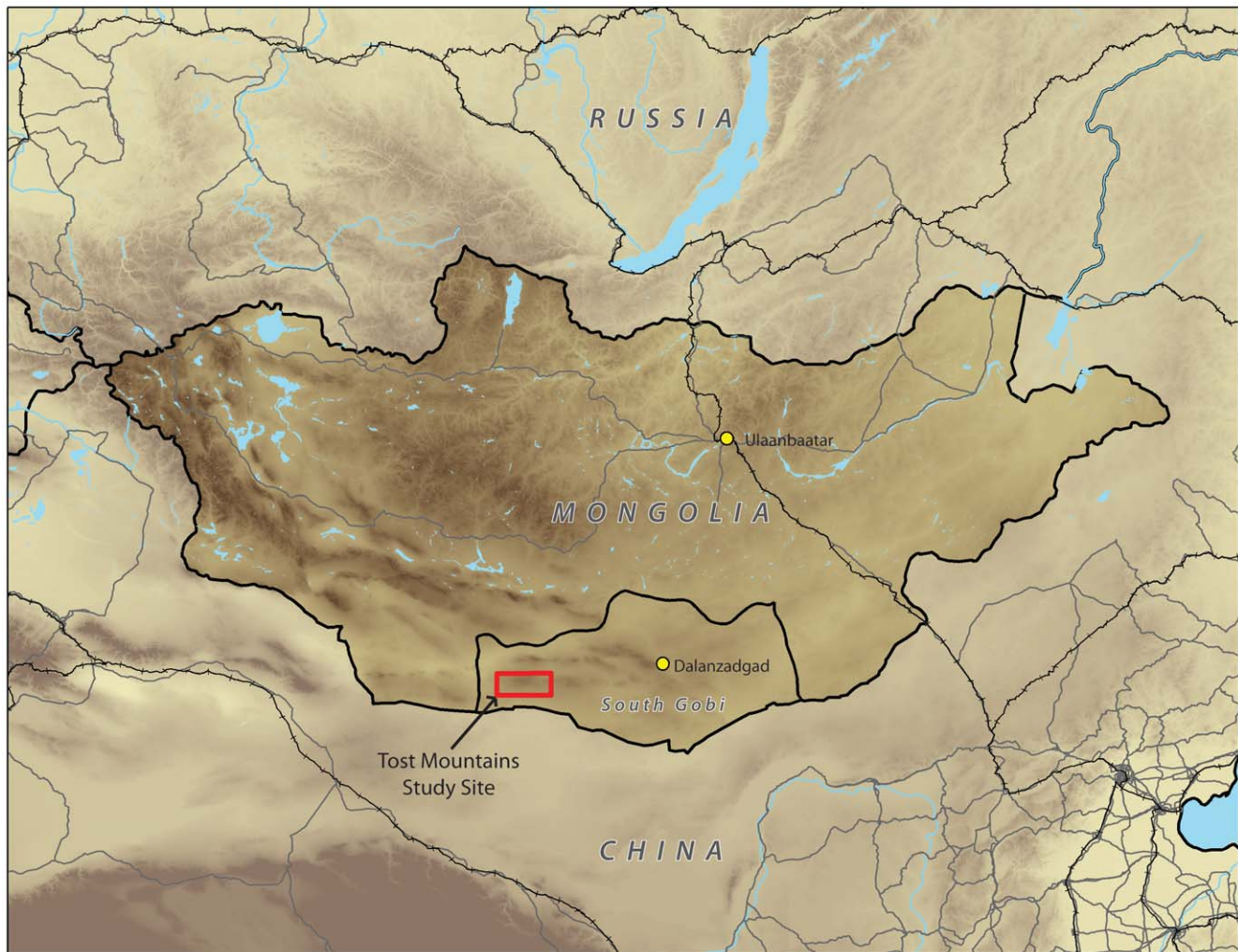
Figure 2. Location of Tost Mountain study site in South Gobi, Mongolia.