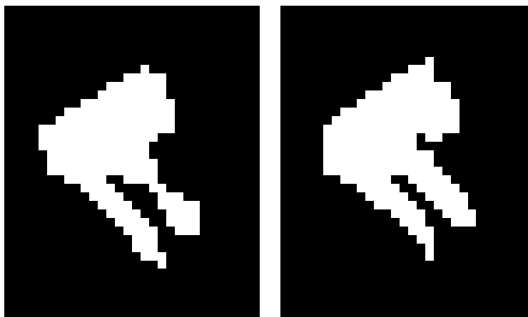
(a) Manual (Case 1)