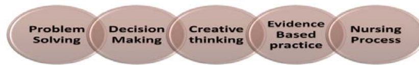
Figure 3. Terms associated with critical thinking

Sub category 3: Terms associated with CT. While sharing different CT perspectives, some participants also used some alternate terms or synonymous expressions or phrases interchangeably, such as problem solving, decision making, creative thinking, nursing process, and evidence based practice to describe CT (see Figure 3). However, after probing, these teachers were able to clarify their perceptions and differentiate these associated terms from CT.