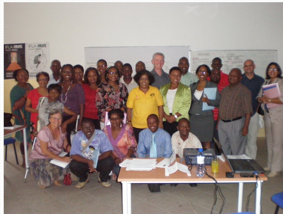
Delegates attending the Public Access to Health Information Workshop in Mozambique, March 2011