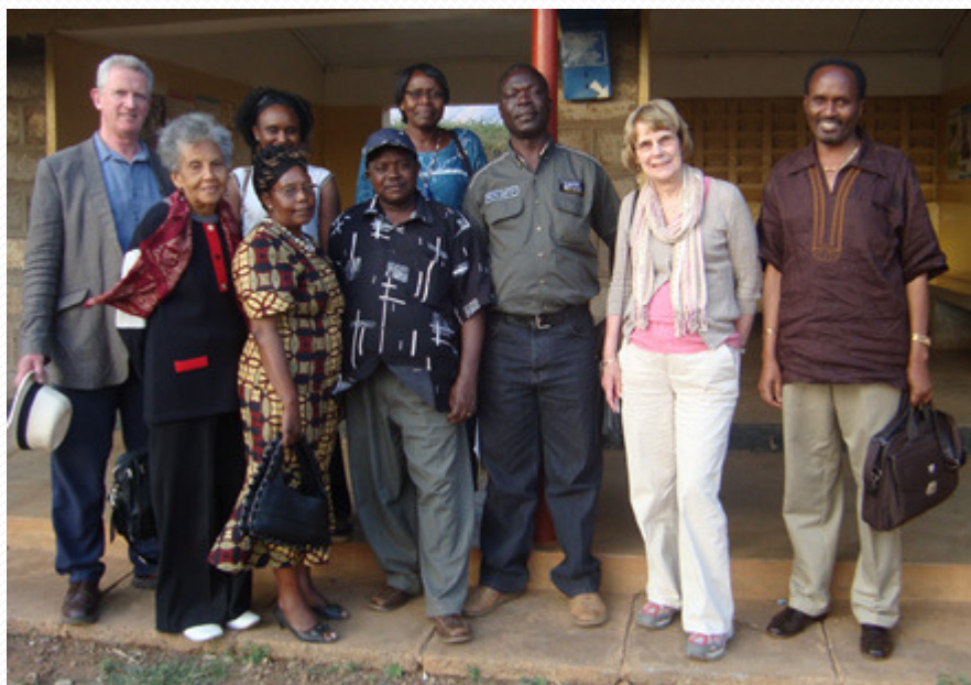
KEN-AHILA members and Public Access to Health Information (PAHI) workshop facilitators. Pilot workshop on PAHI, Kenya, 2009