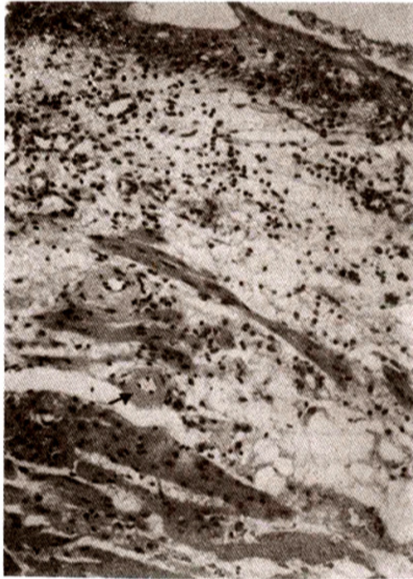
Figure 1. Section of the oesophageal biopsy with overlying mucosa. Submucosal vessels show deposition of an acellular homogenous amyloid material (arrow). H & E 10X.