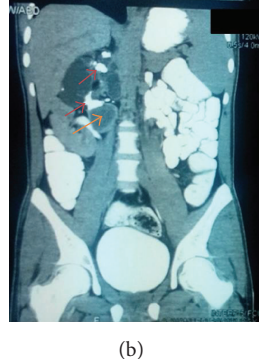
FIGURE 1: Contrast enhanced CT scan showing cystic mass with solid component (marked with orange arrow) and areas of calcification (marked with red arrow). (a) Axial section. (b) Coronal section.