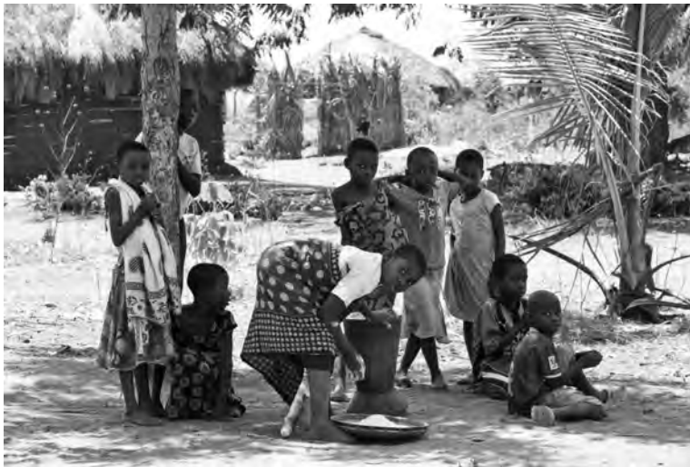
Figure 7: Despite few direct school literacy materials, homes were still full of vibrant contexts of socio-cultural knowledge that could be tapped into for school literacy