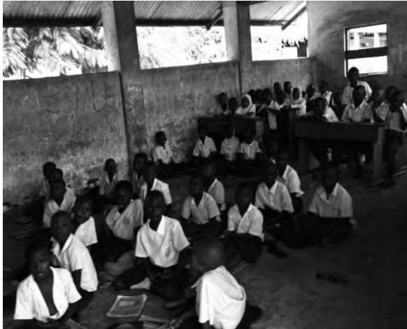
Figure 1: A classroom in which half the children had to sit on the floor and the other half on benches