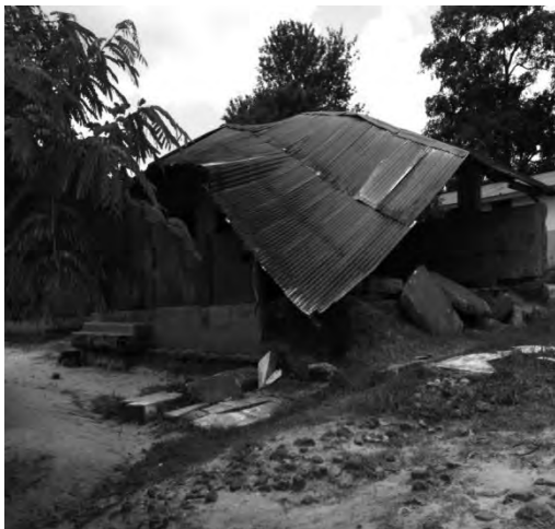
Figure 2: A collapsed school building. Fortunately nobody was hurt in this incident (illustration of the level of neglect)