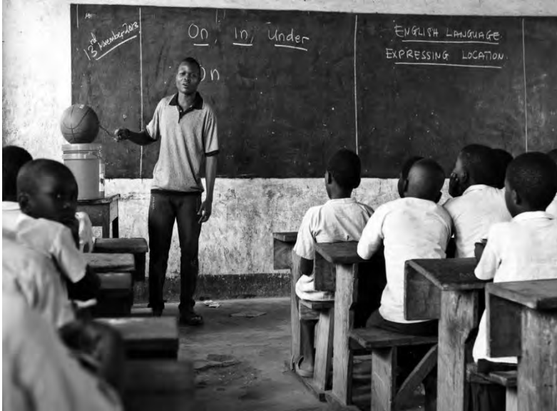
Figure 4: Literacy practices challenged

Even with available teaching materials, teaching remained patchy with no full sentences on the board or full phrases based on prepositions as teaching points.