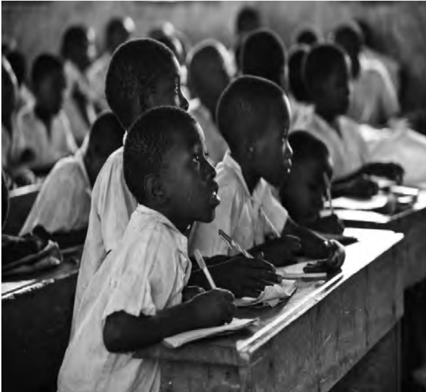
Figure 3: Writing in exercise books – children with inadequate space due to crowding

Under these conditions, facilities and materials were not always ideal – being inadequate in some and completely missing in others, all leaving the children unable to consistently conceptualise the link between the activities of reading and writing and the school structures. Throughout, literacy texts such as charts were not a common feature of the classroom walls and talk around texts was usually absent, factors that severely limited literacy development opportunities for children in these contexts. The extent of barriers to literacy development was mainly due to children missing out on constructive literacy practices – not having undertaken constructive written work in their exercise books up to the end of year and missing out on opportunities to develop texts themselves. The classrooms for the visually impaired had different attributes from the other ordinary classrooms. It was noted that the school with the special visually impaired section was better resourced than other schools although they also needed more. The head teacher revealed that it was a beneficiary of the Roman Catholic Mission of which it was part and, as a result had access to adequate resources although they needed more. Visually impaired teachers taught this class and each child had adequate resources to use – each, their own special typewriter