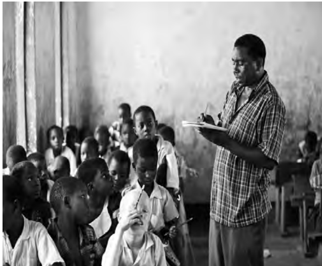
Figure 5: Challenging teaching and learning conditions for literacy development

Even with available teaching materials, teaching remained patchy with no full sentences on the board or full phrases based on prepositions as teaching points.