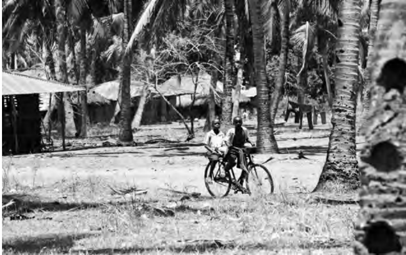
Figure 6: Clustered linear structure – these are not conditions where reading and writing can be central