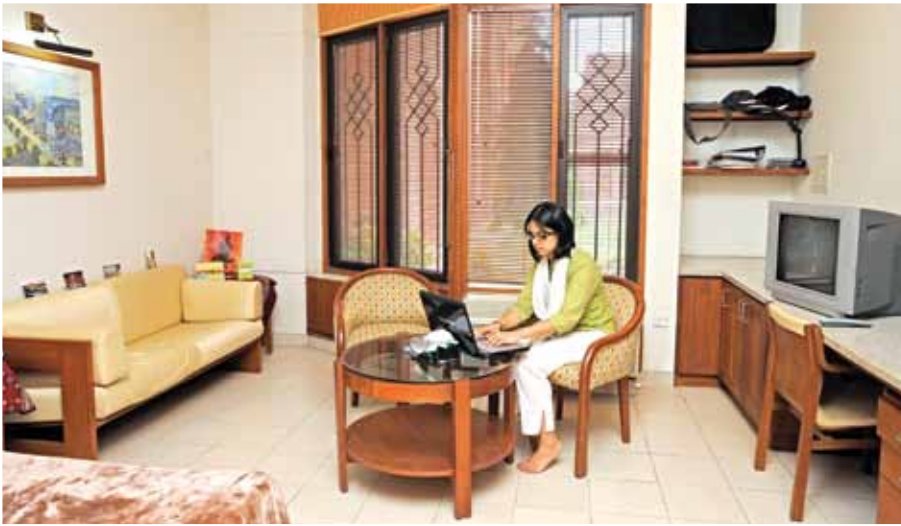
▲ Resident busy working in a fully furnished air conditioned Studio Apartment, with access to a cafeteria, laundry and common rooms