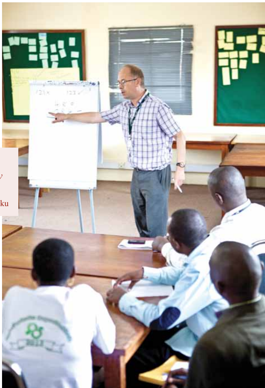
Students attending a session at IED, East Africa