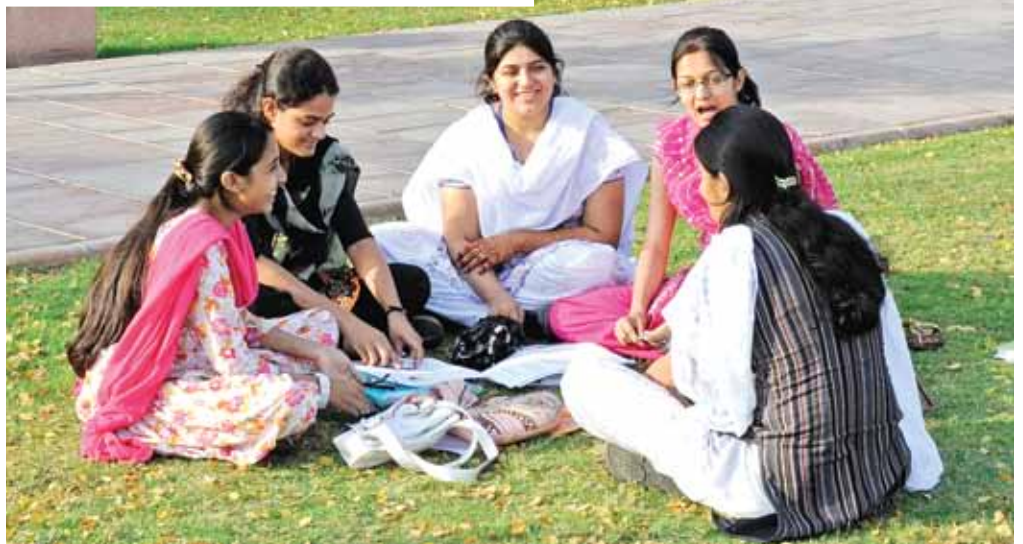
▲ Since the Residences house women from different backgrounds and locations from across Pakistan, there is the opportunity to network widely