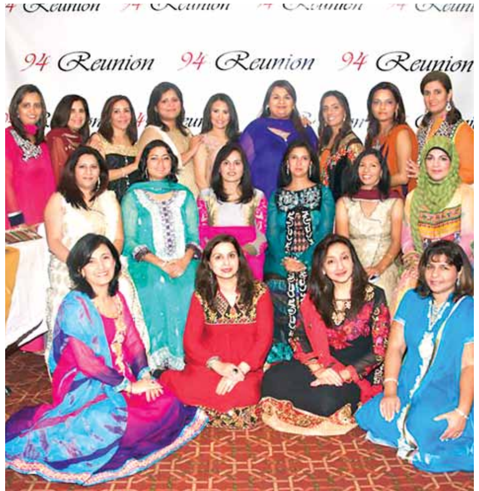
Diploma in Nursing, Class of 1994 reunites in Houston after 20 years

Those of us living in Houston took on the responsibility of organizing everything for members visiting from elsewhere. Eighteen girls (nurses would perhaps be more appropriate) from our class came