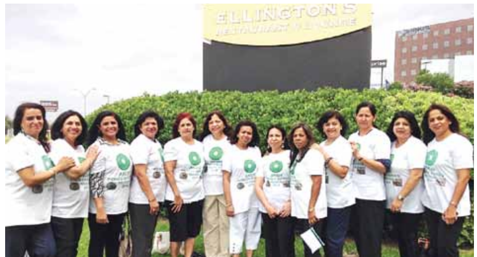
AKU SONAM's first Class

The get together made us realize that AKU has instilled a lifelong desire for learning in all its graduates. It has played a significant role in building skills and confidence amongst us to go out and face the challenges of this progressing world and then utilize those skills and knowledge to make a difference in our lives and our communities at large. ■