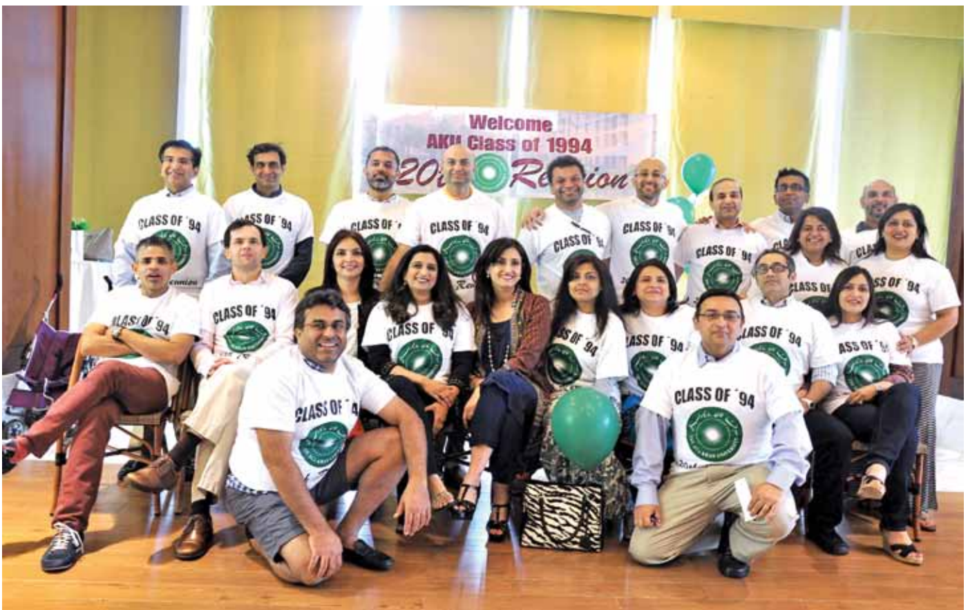
20th Reunion of the AKU Medical College MBBS Class of '94

The next reunion will be held on August 14 at the Gaylord Resort, Orlando. Elections will be held then, so all alumni are invited to run for office as President, Secretary or Treasurer. ■