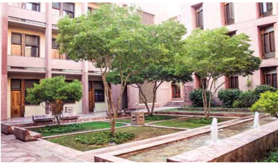
▲ The calm and serene environment rejuvenates residents for the next hectic working day