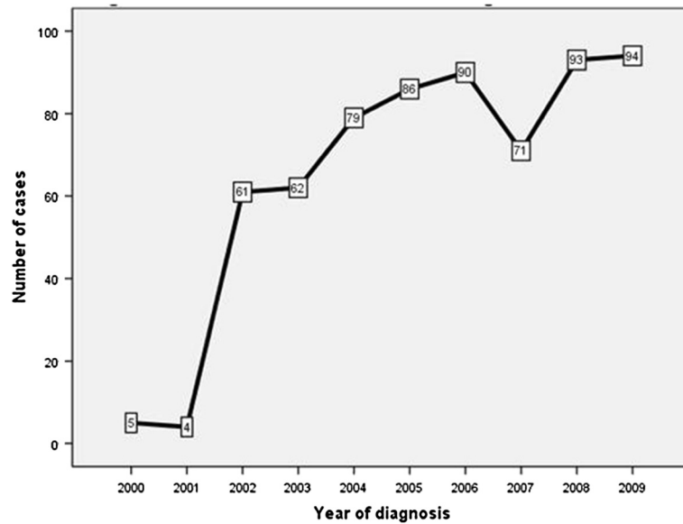
Figure 1 Year wise trends of HCC cases during 1999 till 2009.

hypertension or dyslipidemia was found in 40.2%, 34.4% and 2.5% of the cases, respectively. Most of the HCC cases (82.9%) were diagnosed when they were symptomatic, while only 8.2% HCC cases were diagnosed on screening. The duration between diagnosis of chronic liver disease and HCC was 24.01 \pm 38.05 months (range 0–195 months). Moreover, majority of patients (62.8%)