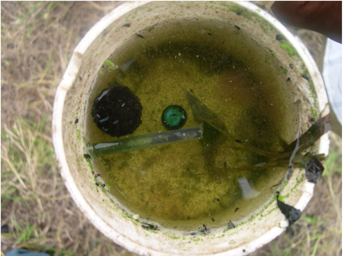
Figure 4 Dipper content from sewage pond in Temeke municipality (Figure 3).