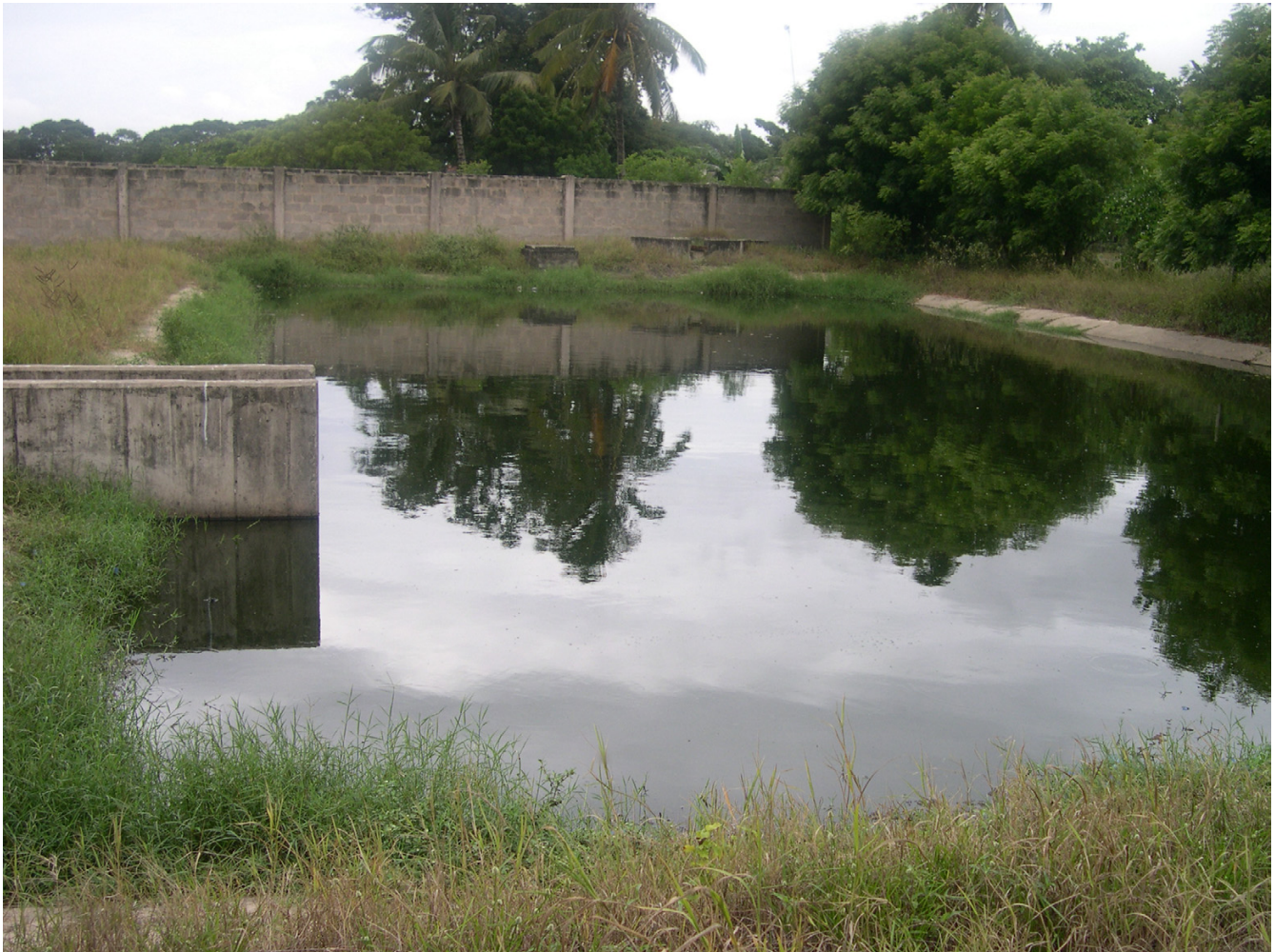
Figure 3 Sewage pond in Temeke municipality, Dar es Salaam, Tanzania.