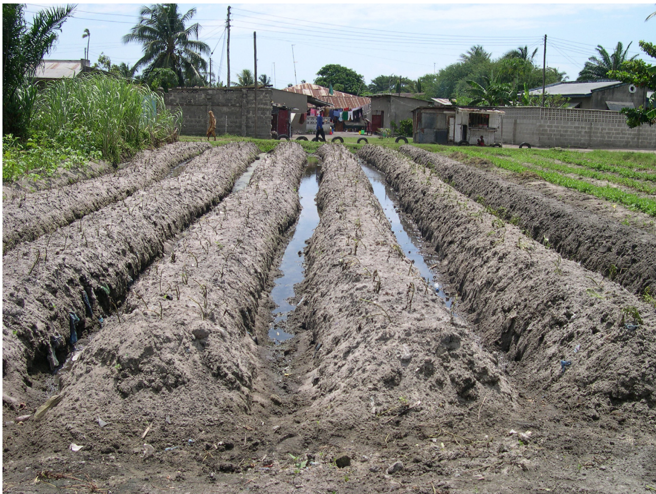
Figure 5 "Matuta" type of agriculture in Dar es Salaam, Tanzania.

potentially important for mosquito control interventions. Further, mosquitoes do not necessarily lay eggs every day in each potential breeding site, thus the reason why a site did not contain larvae could simply be because no eggs were deposited within the last week.