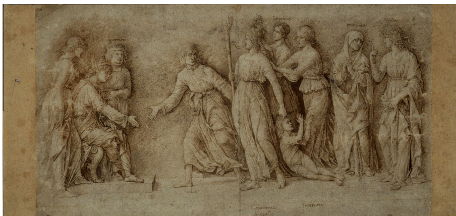
Figure 1 The Calumny of Apelles, drawing by Andrea Mantegna (≈1504–6). Available online at: http://www.britishmuseum.org/explore/highlights/highlight_objects/pd/a/mantegna_calumny_of_apelles.aspx . The picture is explicitly explained on the British Museum Website as follows: ‘Each of the figures is identified in Mantegna’s handwriting. Sitting on a throne is the judge with large, ass’s ears, extending his hand to Calumny (Slander). Behind him stand Suspicion on the left and Ignorance on the right, who maliciously advise him. Calumny holds a torch in one hand to suggest her blazing fury, and with the other hand drags a young man by the hair. He stretches out his hands to heaven and asks the gods to witness his innocence. Envy, a thin pale man, leads Calumny, while two servants, Treachery and Deceit, adjust her hair and dress. The last two figures in the procession are Repentance, a mourning woman who wrings her hands, and finally Truth, pointing to heaven and with tears in her eyes.’ Reproduced with permission from the British Museum Website. Lessons for urologists: The deceitful nature of society has not changed from Greek times – the many drawings and paintings depicting the Calumny of Apelles all use a Greek description (and the artists imagination/biographicisation) to reconstruct the scene. Perhaps the problem is that this topic (discussed in liberal arts programmes) loses its impact as it is not brought to the attention of urology residents and young faculty. The persistence of corrupted society would be a very useful topic for physicians to attack (as it is the basis of many diseases). However, it will take the lifespan of a host of courageous individuals to develop pragmatic solutions!

The most useful LL for the physician, would be continuous, have no endpoint, no pre-formed curriculum, and no assessment other than as a special auto-generated, reflective, ‘meta-cognitive’ activity. However, it would have a well defined source for learning (society) and well defined direction (benefit to society). Whilst learning from society and building relational networks, it must proffer services valued by society. It is internally driven, in contrast to the externally motivated learning that we undertake because of specific vocational/professional needs such as re-certification and job transitions.