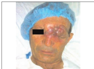
Figure 1: Hyperemic mass at medial canthus of left eye and over glabella, pre-operative photograph.