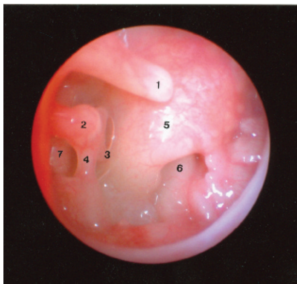
Figure 1. Endoscopic view of a right-sided middle ear shows the handle of the malleus (1), the incudostapedial joint (2), the posterior crura of the stapes (3), the stapedius tendon (4), the promontory (5), the round window (6), and the facial recess (7).

our practice and began to incorporate rigid otoendoscopy into our tympanoplasty procedures; we identified 41 patients who had undergone initial endoscopy from then until the end of the study on Dec. 31, 2002. In this group, scutum lowering was performed only when the middle ear could not be completely visualized by endoscopy.