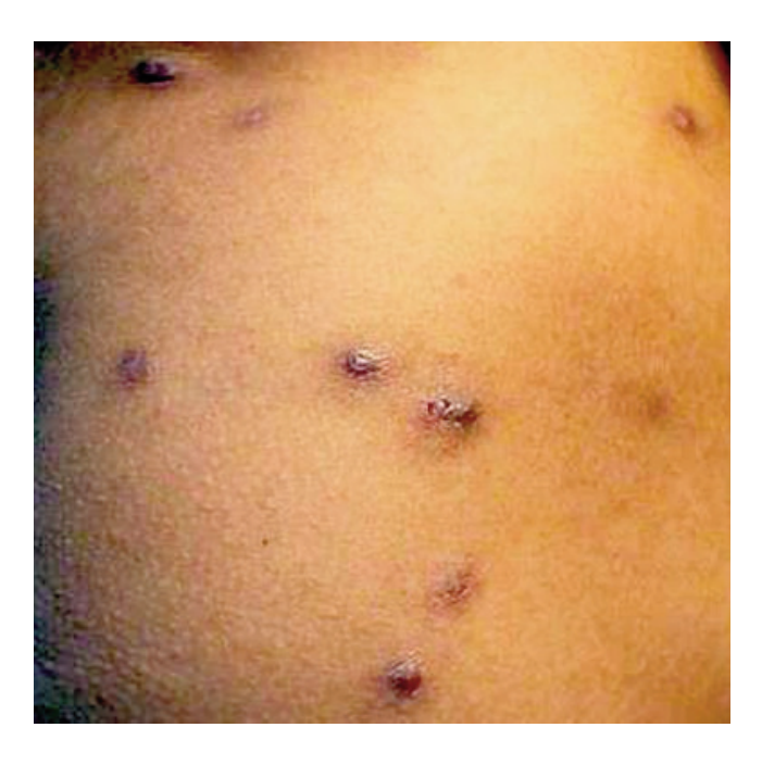
Figure-2: Crusted papules of prurigo on the buttocks.