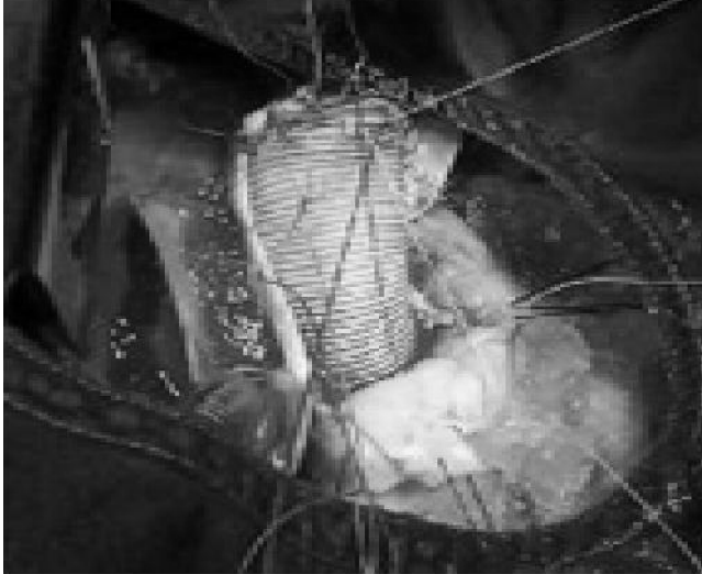
Figure-2: Intra-operative: aortic root replacement.

planned for Computed Tomographic angiography, which showed normal coronary arteries but aortic dissection starting above the cusps and extending down to D8. A diagnosis of acute aortic dissection with severe aortic regurgitation was made. The patient was planned for aortic root replacement with aortic valve conduit and reimplantation of coronary arteries, electively.