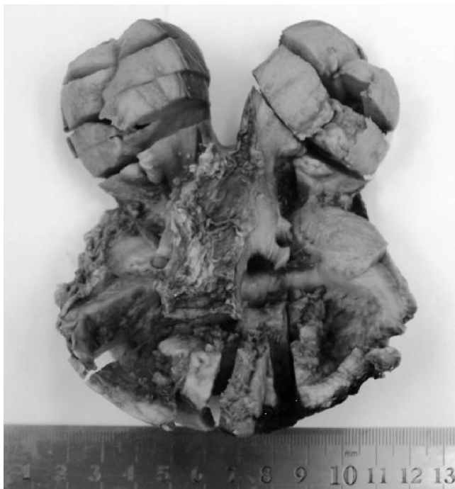
Figure-2: Didelphys uterus with double vagina showing clear cell adenocarcinoma involving left vagina (arrow).

Grossly the specimen consisted of two uteri, two cervixes and two vaginas along with bilateral external iliac and obturator lymph nodes. Right sided uterus, cervix and vagina measured 9.5 X 4 X 2.5cm in the greatest