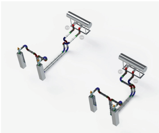
Figure 2: Schematic view of high power Transmission Line (I) of TARLA.