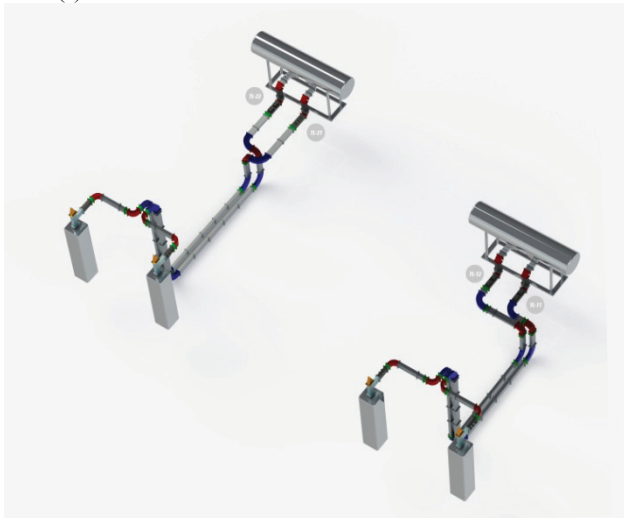
Figure 3: Schematic view of high power Transmission Line (II) of TARLA.

have four RF transmission lines connected to four HPRF amplifiers. It has been studied on different types of transfer line system designs [4]. Each general transfer line system for four transmission lines are named as Transmission Line (#).